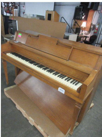
LOT 170 _____