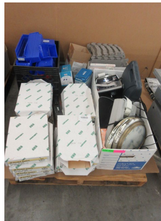
LOT 105 _____