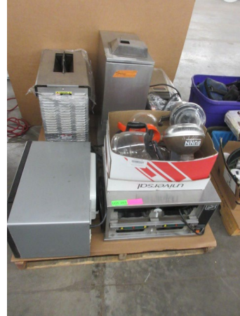
LOT 161 _____