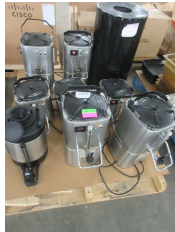
LOT 149 _____