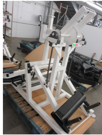
LOT 175 _____