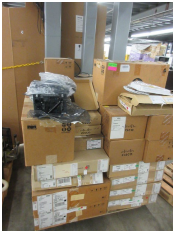
LOT 116 _____