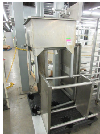
LOT 153 _____