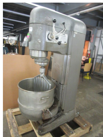
LOT 171 _____