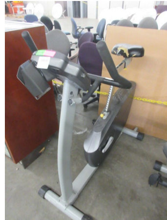
LOT 167 _____