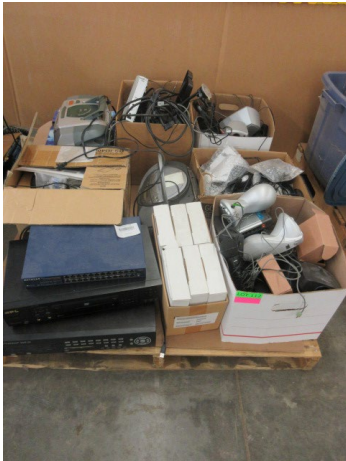
LOT 112 _____