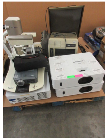
LOT 111 _____