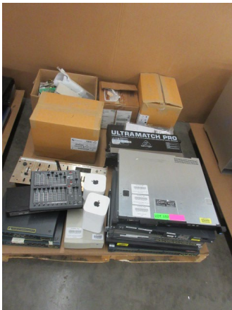
LOT 102 _____