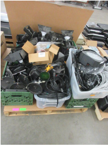
LOT 130 _____