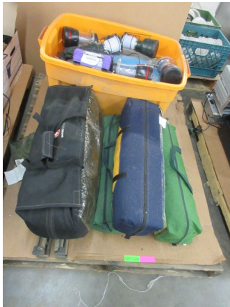
LOT 124 _____