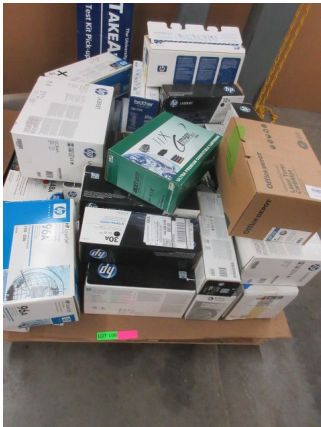
LOT 108 _____