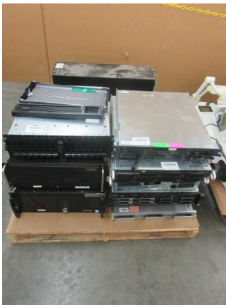
LOT 110 _____