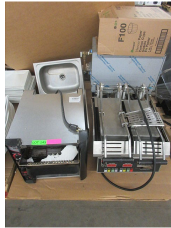
LOT 145 _____