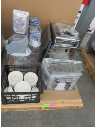
LOT 160 _____