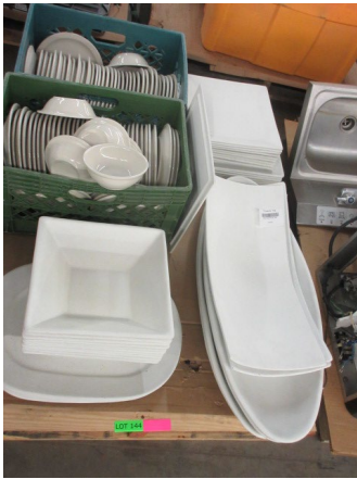
LOT 144 _____