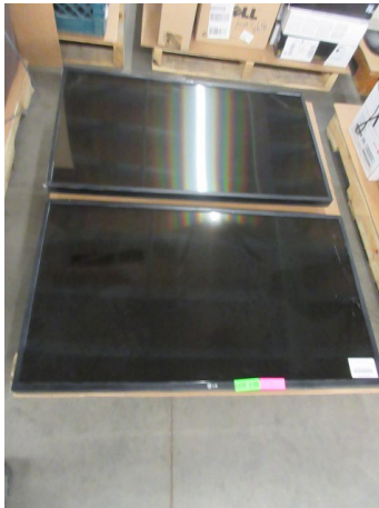
LOT 138 _____