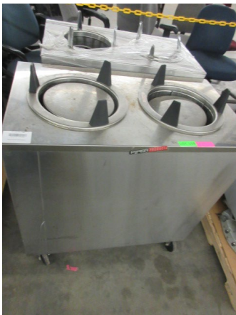
LOT 158 _____