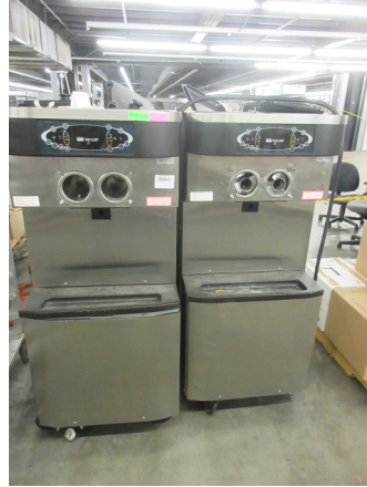
LOT 155 _____