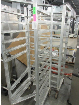
LOT 154 _____