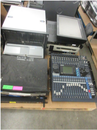
LOT 132 _____