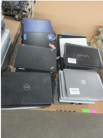
LOT 136 _____