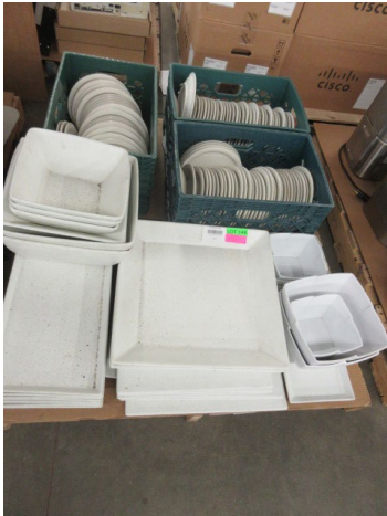
LOT 148 _____