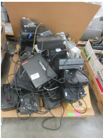
LOT 122 _____