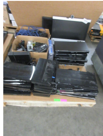
LOT 139 _____