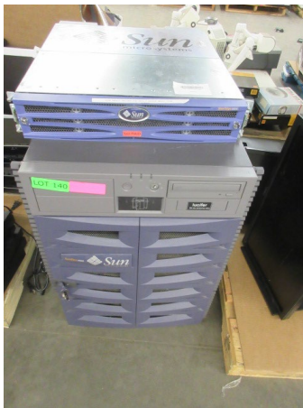
LOT 140 _____