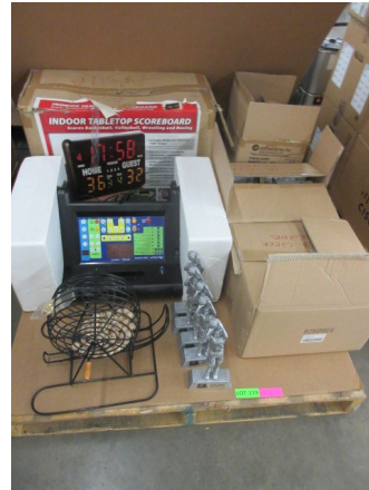
LOT 119 _____