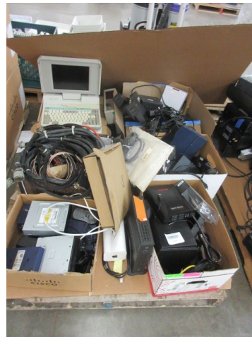
LOT 121 _____