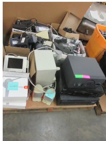
LOT 123 _____