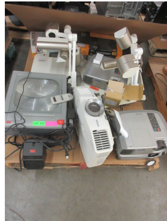
LOT 127 _____