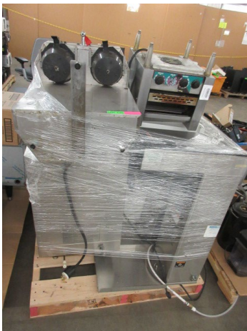
LOT 146 _____