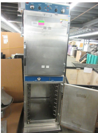
LOT 152 _____