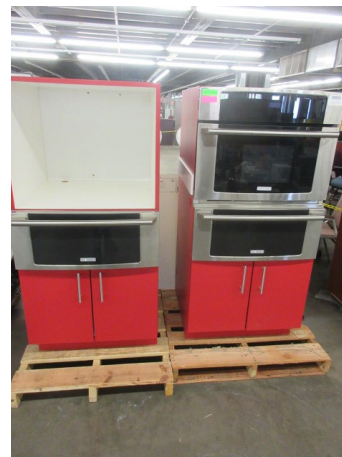
LOT 165 _____