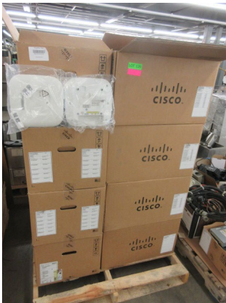
LOT 120 _____