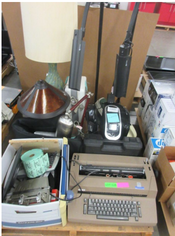
LOT 128 _____