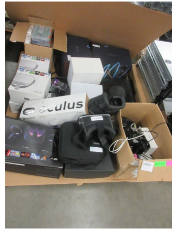
LOT 131 _____