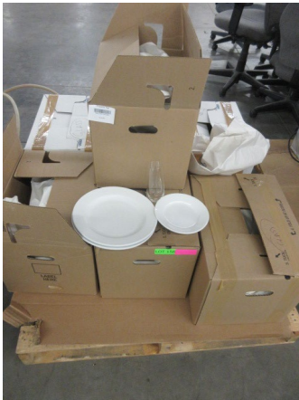
LOT 156 _____