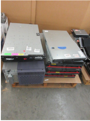
LOT 106 _____