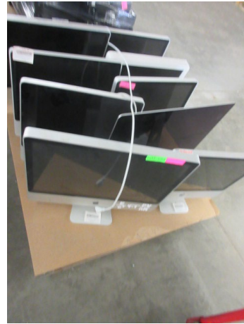
LOT 133 _____