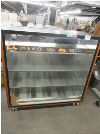
LOT 166 _____