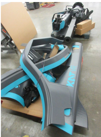
LOT 176 _____