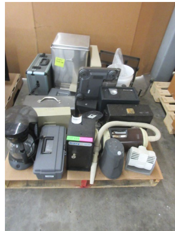
LOT 115 _____