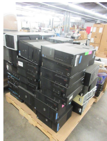
LOT 117 _____