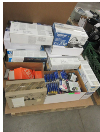
LOT 129 _____