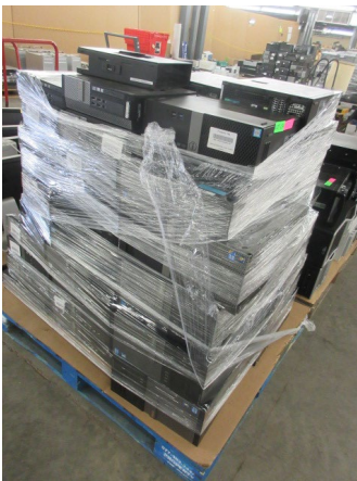
LOT 134 _____