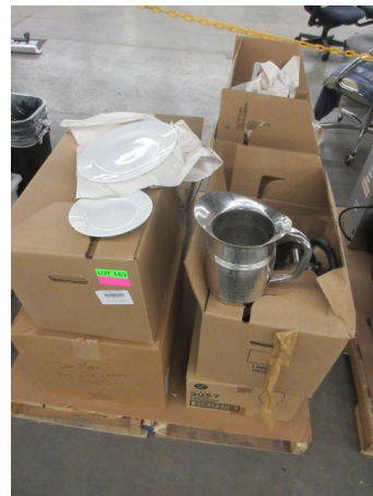
LOT 163 _____