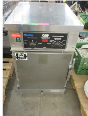
LOT 143 _____