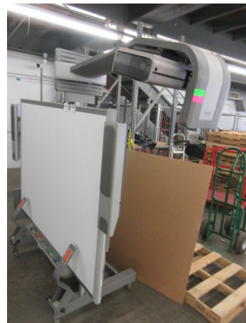
LOT 177 _____