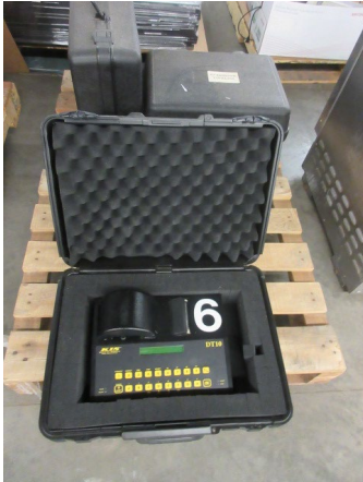
LOT 142 _____