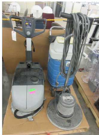
LOT 159 _____