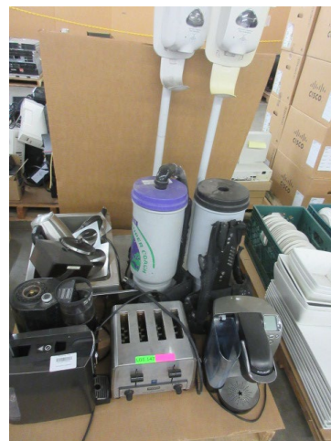
LOT 147 _____