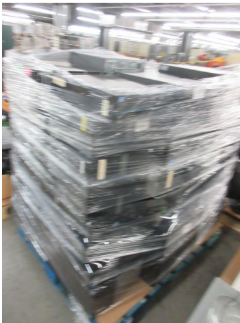
LOT 126 _____