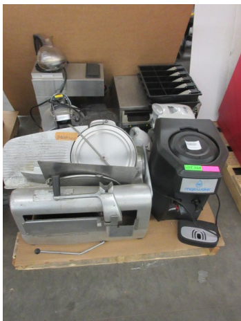
LOT 164 _____