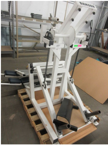
LOT 174 _____