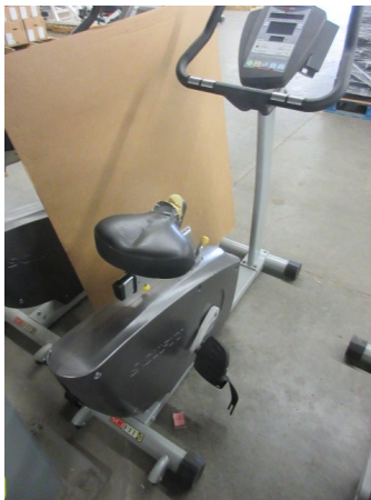
LOT 168 _____