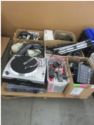
LOT 104 _____