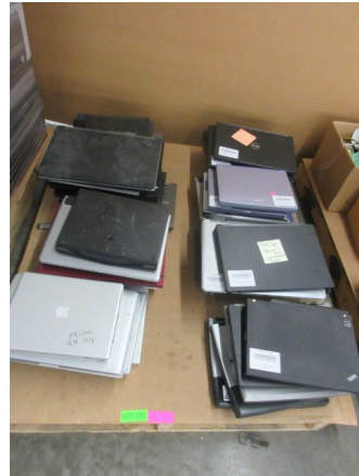
LOT 101 _____