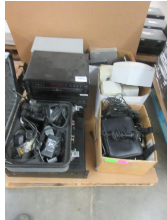
LOT 125 _____