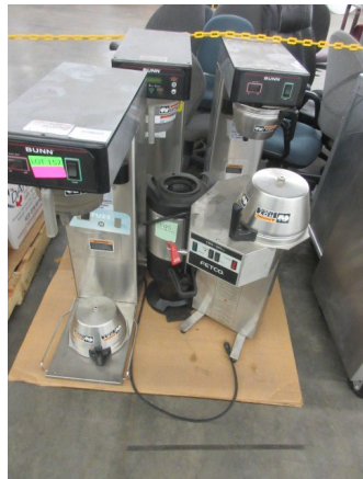
LOT 157 _____