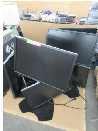
LOT 141 _____