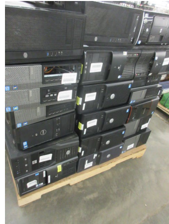
LOT 109 _____