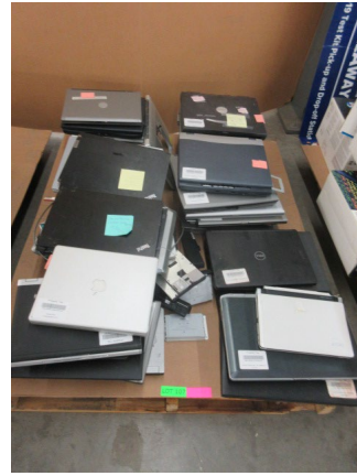
LOT 107 _____