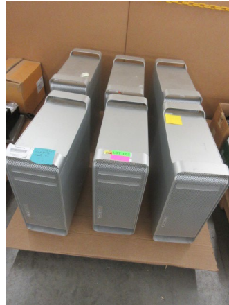
LOT 103 _____