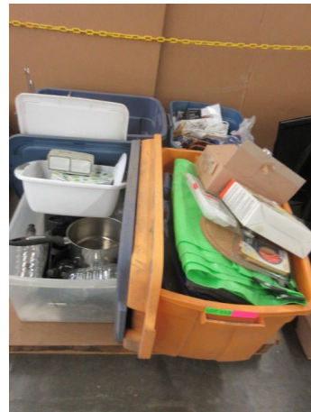
LOT 113 _____