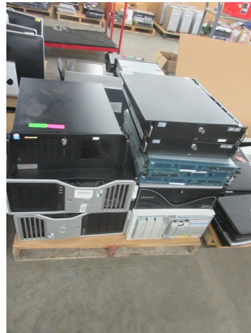
LOT 135 _____