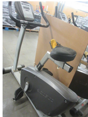
LOT 169 _____