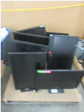
LOT 114 _____