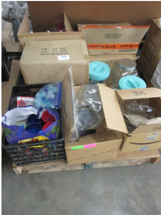
LOT 118 _____