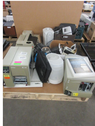
LOT 137 _____