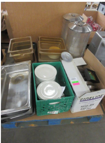
LOT 150 _____