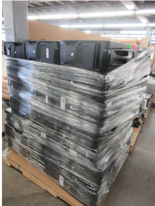
LOT 100 _____

***ONLY EVEN DOLLAR AMOUNTS WILL BE ACCEPTED NO CENTS PLEASE***