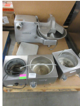
LOT 151 _____