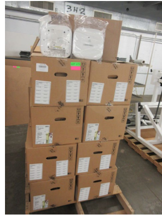
LOT 173 _____