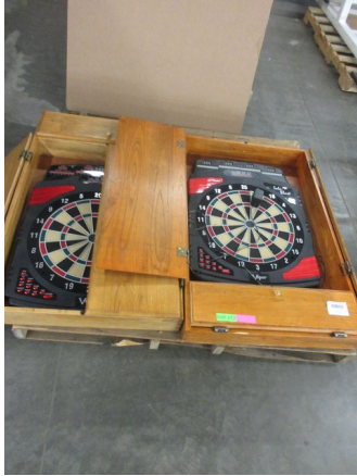
LOT 172 _____