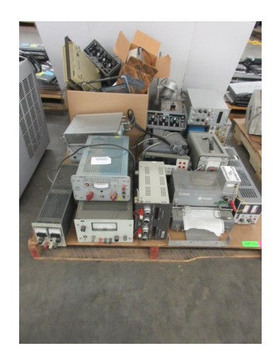
LOT 111 _____ January Lab Equipment & Supplies auction