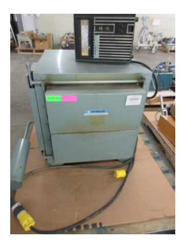
LOT 118 _____