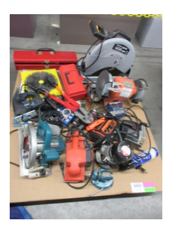
LOT 171_____ January Lab Equipment & Supplies auction