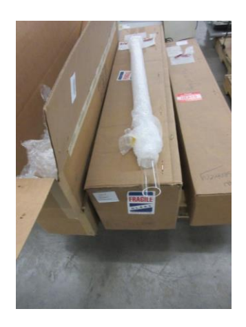
LOT 144 _____