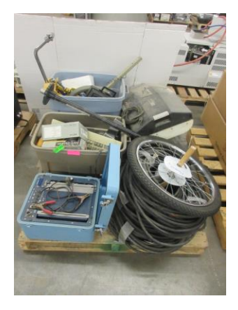
LOT 143 _____