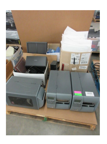
LOT 132 _____