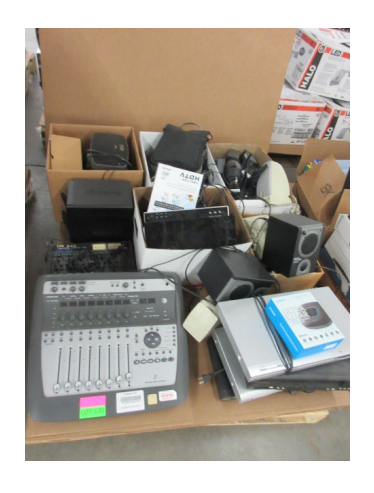
LOT 131 _____