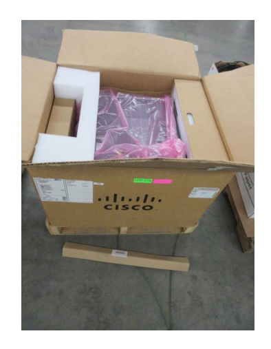
LOT 178 _____