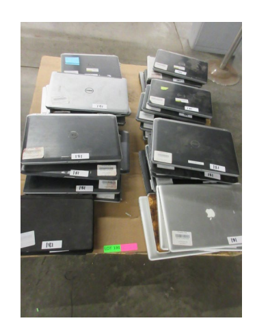
LOT 181 _____