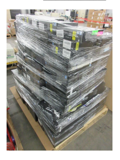
LOT 156 _____