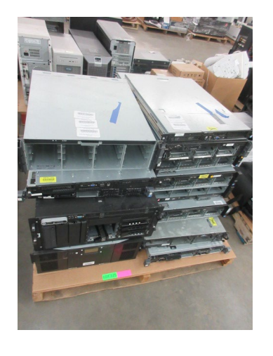
LOT 125 _____