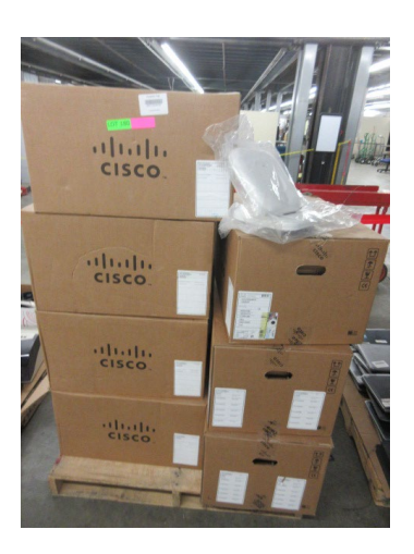
LOT 180 _____