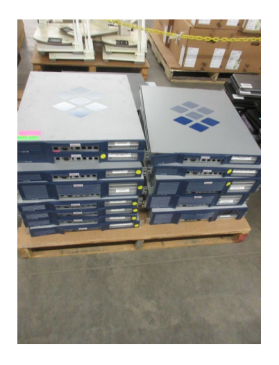
LOT 167 _____