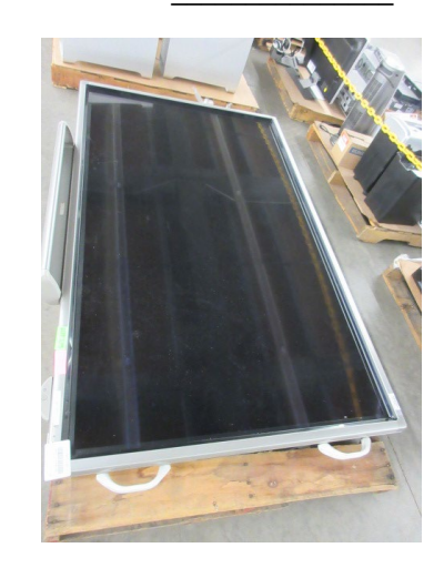
LOT 175 _____