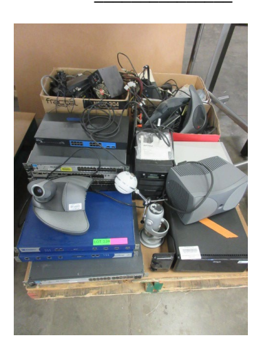
LOT 134 _____