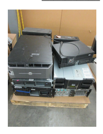
LOT 109 _____