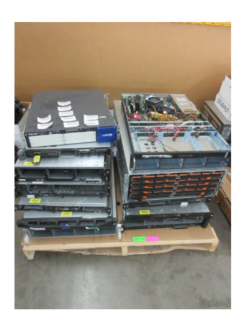
LOT 102 _____