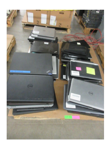
LOT 168 _____