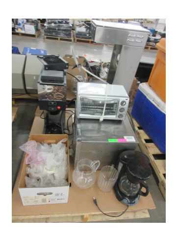
LOT 121 _____