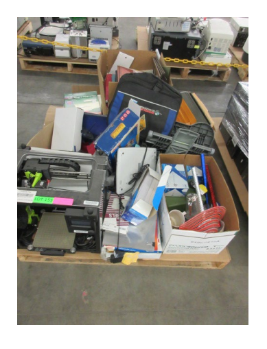
LOT 155 _____