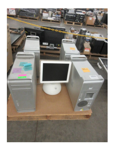
LOT 174 _____