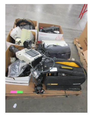
LOT 179 _____