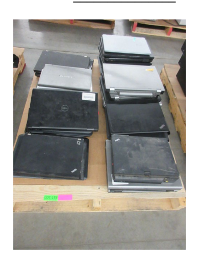
LOT 158 _____