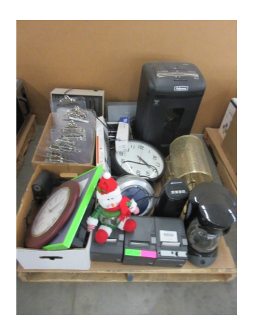
LOT 104 _____