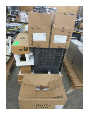
LOT 173 _____