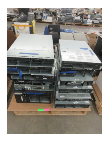
LOT 120 _____