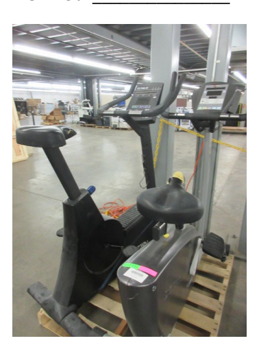
LOT 151 _____