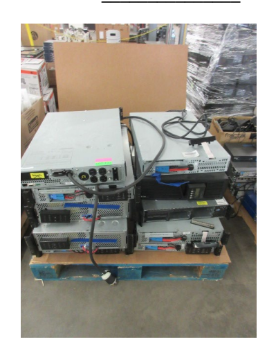
LOT 133 _____