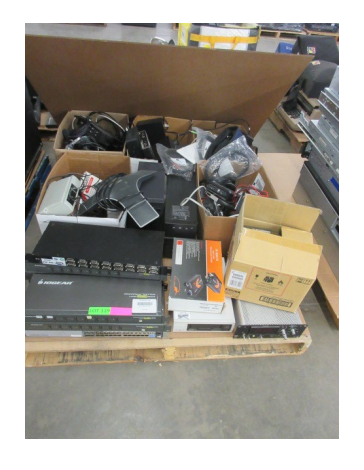
LOT 119 _____