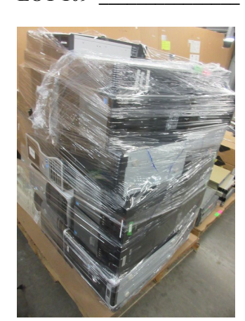
LOT 111 _____