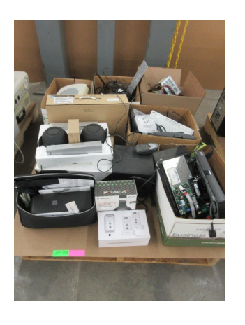
LOT 108 _____