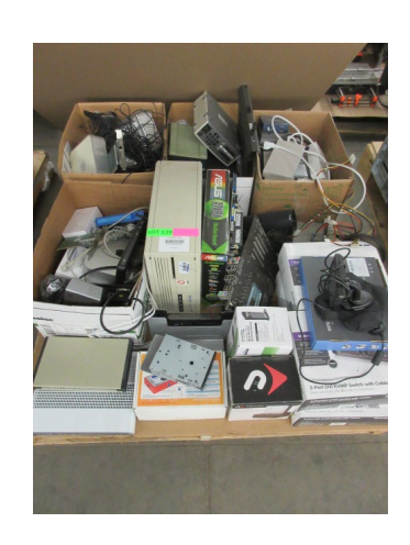
LOT 139 _____