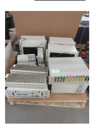
LOT 128 _____