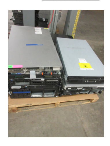
LOT 169 _____