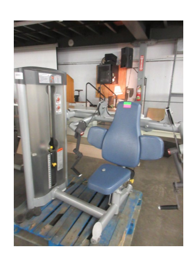
LOT 183 _____

February Computer and Miscellaneous auction