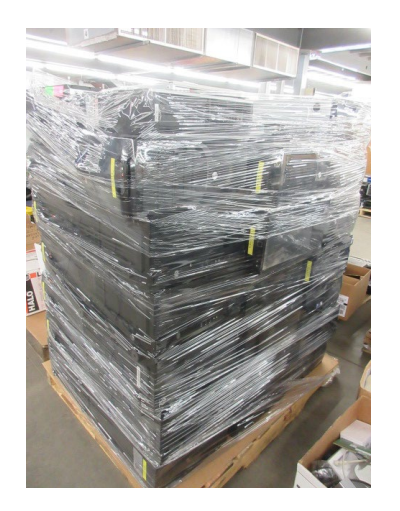
LOT 138 _____