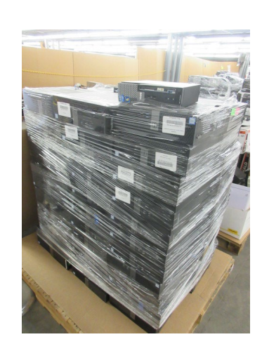
LOT 135 _____

February Computer and Miscellaneous auction