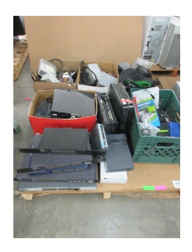
LOT 124 _____