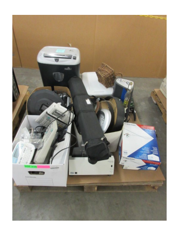
LOT 110 _____