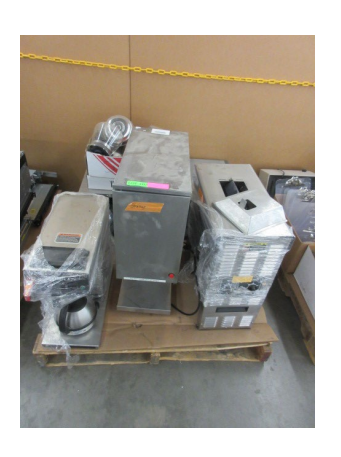
LOT 103 _____