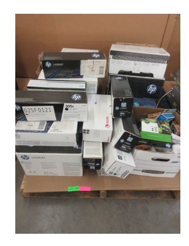
LOT 105 _____