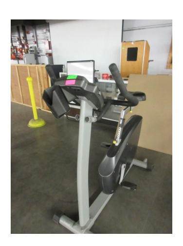
LOT 182 _____