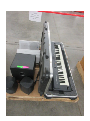
LOT 177 _____

February Computer and Miscellaneous auction