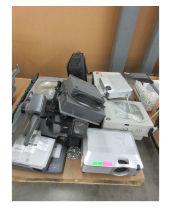
LOT 107 _____