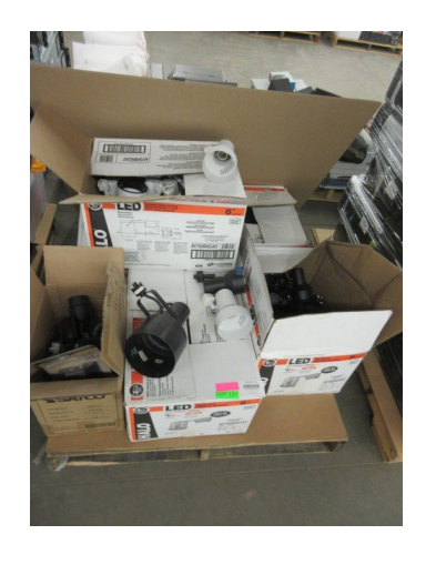
LOT 137 _____