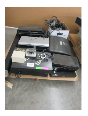
LOT 101 _____