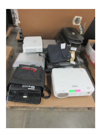
LOT 126 _____