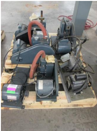
LOT 108 _____