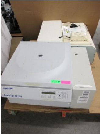
LOT 136 _____