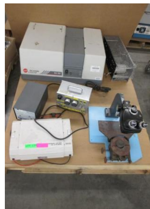
LOT 129 _____