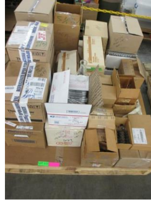
LOT 113 _____