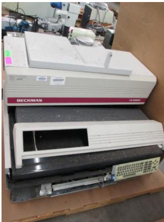
LOT 144 _____