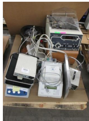
LOT 127 _____