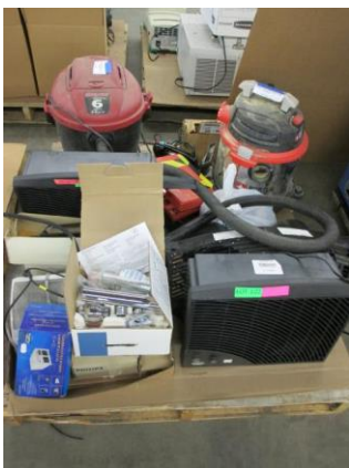
LOT 122 _____