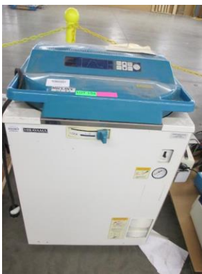
LOT 104 _____