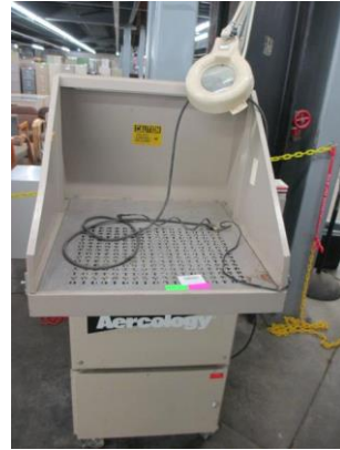
LOT 173 _____