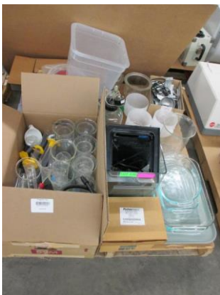
LOT 128 _____