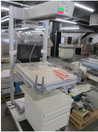
LOT 130 _____