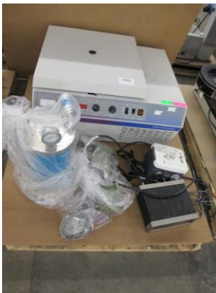
LOT 126 _____