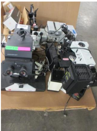
LOT 134 _____