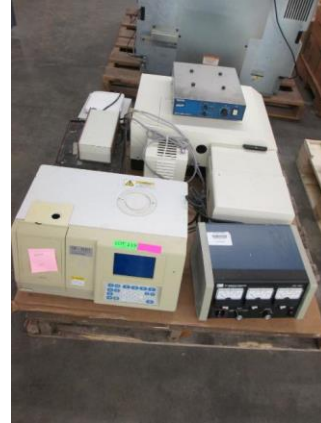
LOT 119 _____