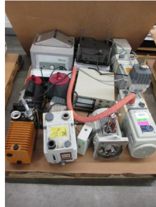
LOT 137 _____