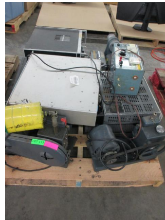
LOT 115 - _____