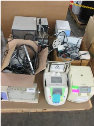
LOT 112 _____