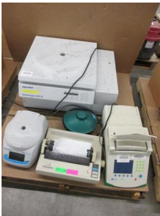
LOT 146 _____