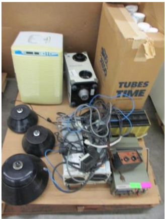
LOT 140 _____