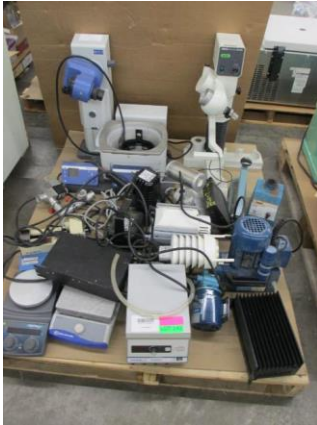
LOT 142 _____