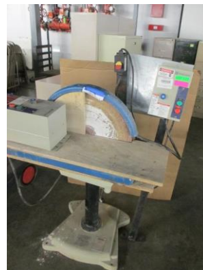
LOT 177 _____