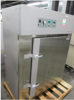
LOT 172 _____