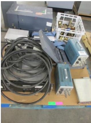
LOT 110 _____