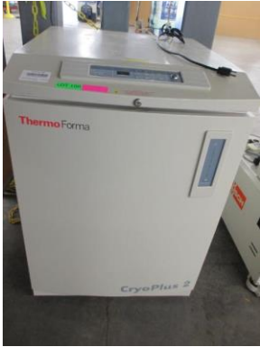
LOT 100 _____

***ONLY EVEN DOLLAR AMOUNTS WILL BE ACCEPTED NO CENTS PLEASE*