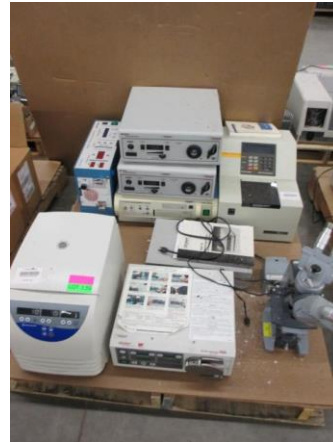
LOT 139 _____