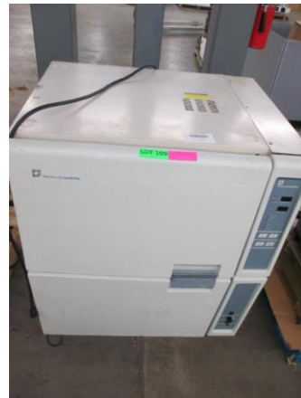
LOT 109 _____