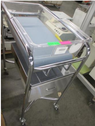
LOT 132 _____