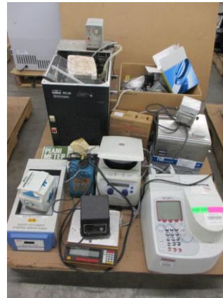
LOT 145 _____