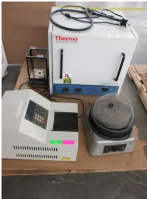
LOT 102 _____