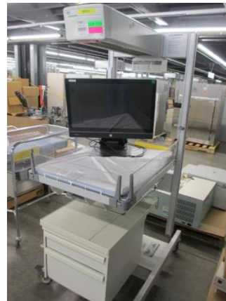
LOT 133 _____