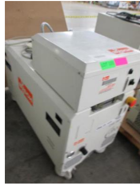
LOT 101 _____