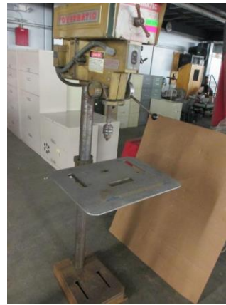
LOT 175 _____