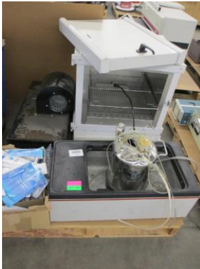
LOT 124 _____