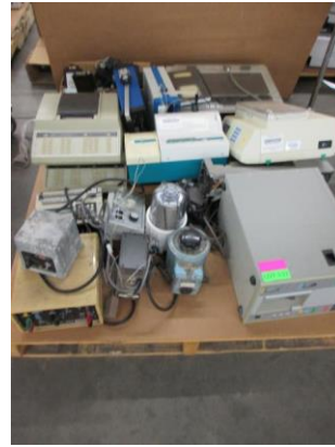
LOT 131 _____