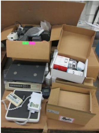
LOT 138 _____