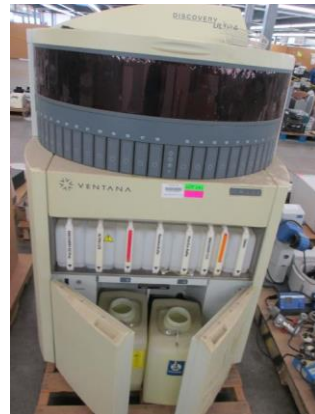
LOT 141 _____