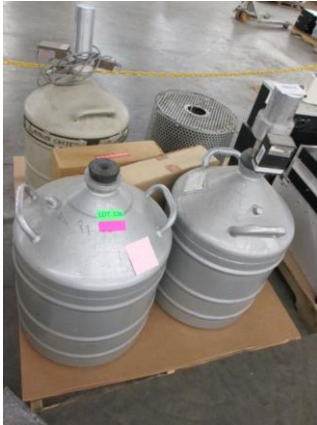
LOT 106 _____