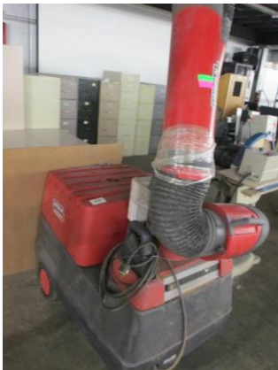
LOT 176 _____