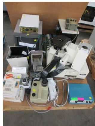
LOT 111 _____