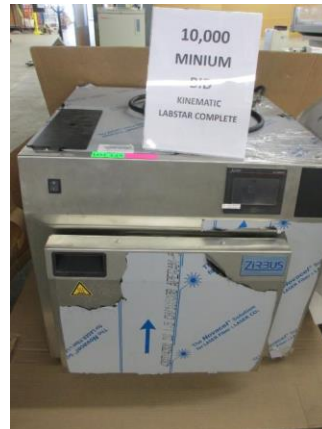
LOT 135 _____