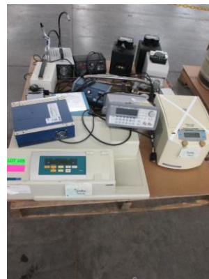
LOT 105 _____