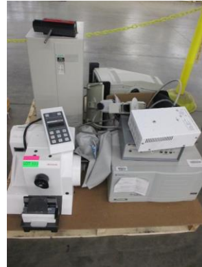
LOT 103 _____