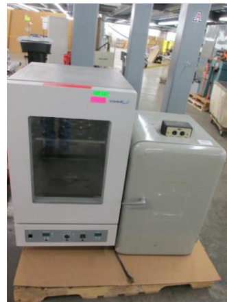
LOT 117 _____