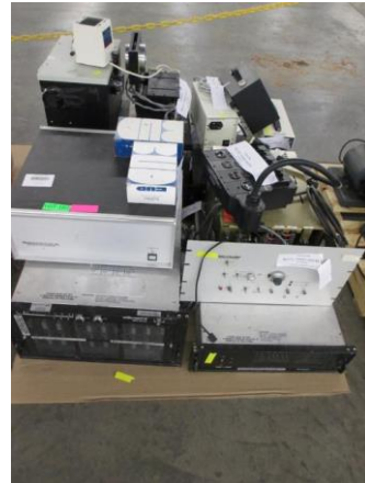
LOT 107 _____