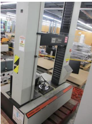
LOT 116 _____