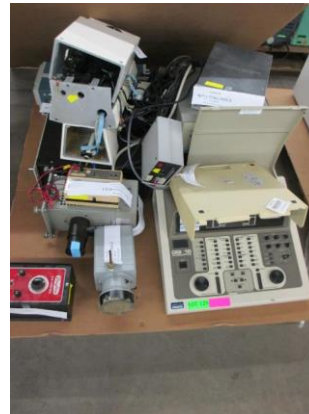
LOT 125 _____