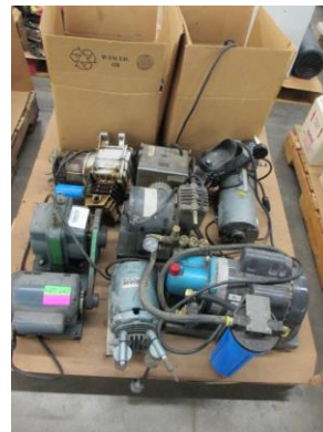
LOT 147 _____