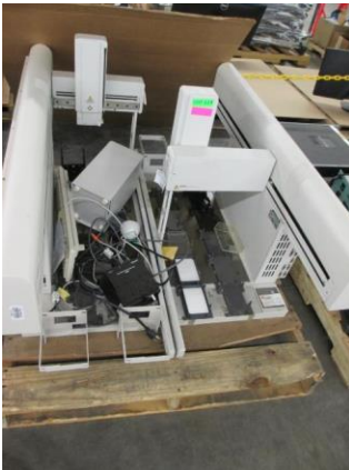
LOT 114 _____