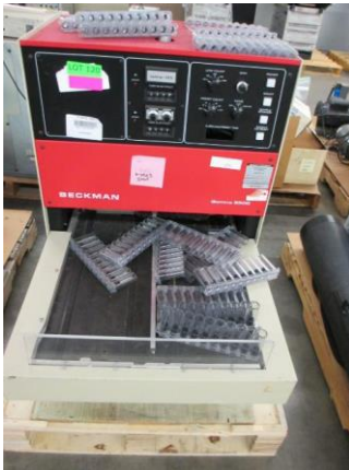
LOT 120 _____