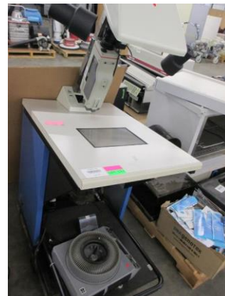
LOT 123 _____