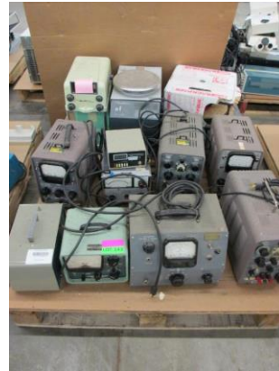
LOT 143 _____