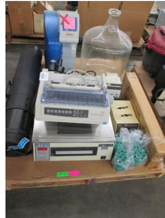
LOT 121 _____