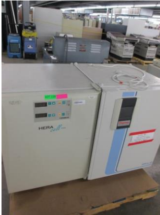
LOT 118 _____