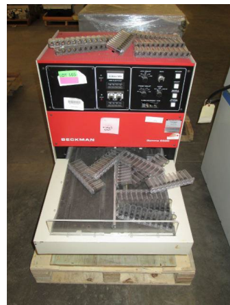
LOT 165 _____