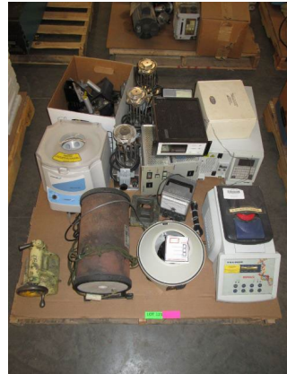
LOT 121 _____