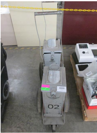
LOT 180 _____