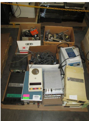
LOT 128 _____