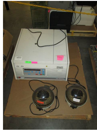
LOT 127 _____