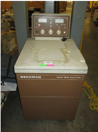
LOT 132 _____