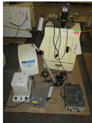
LOT 117 _____