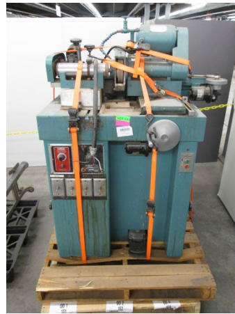
LOT 193 _____