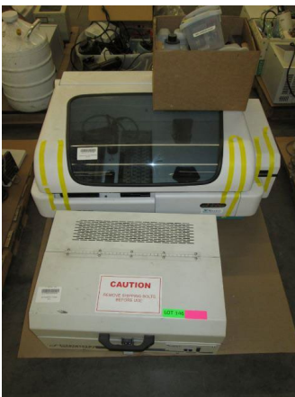
LOT 146 _____