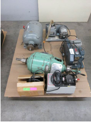
LOT 184 _____