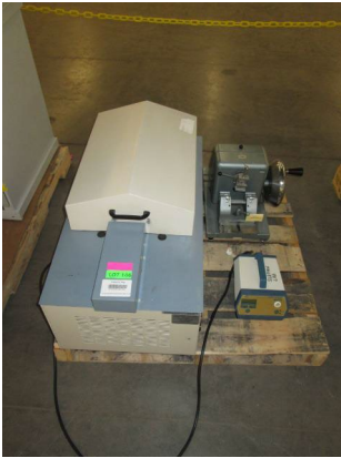
LOT 106 _____