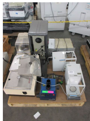
LOT 129 _____