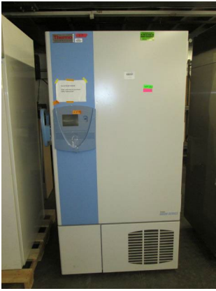
LOT 202 _____