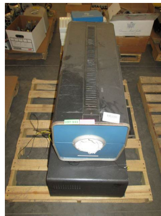
LOT 111 _____