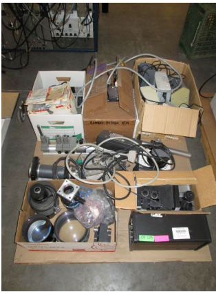
LOT 126 _____