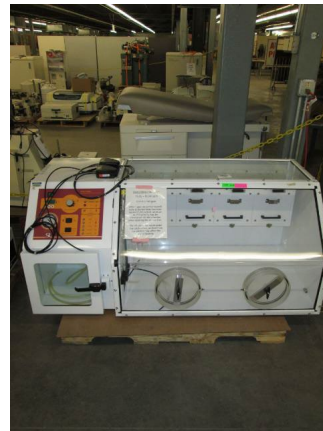
LOT 115 _____