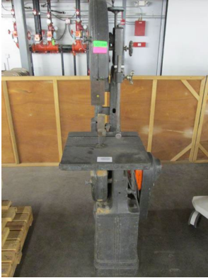
LOT 196 _____