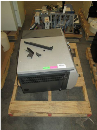
LOT 144 _____