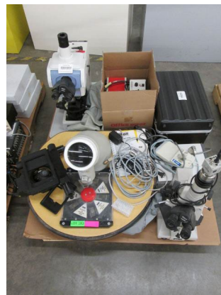
LOT 183 _____