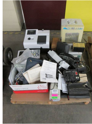
LOT 181 _____