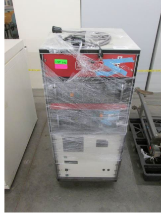
LOT 191 _____