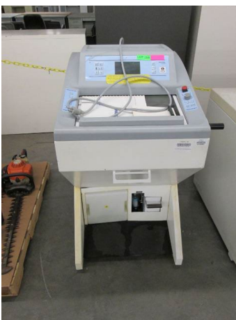
LOT 188 _____