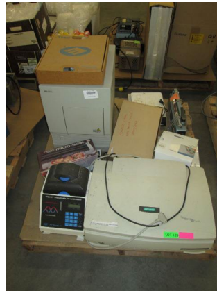
LOT 139 _____