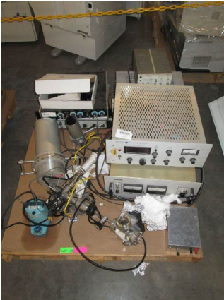
LOT 130 _____