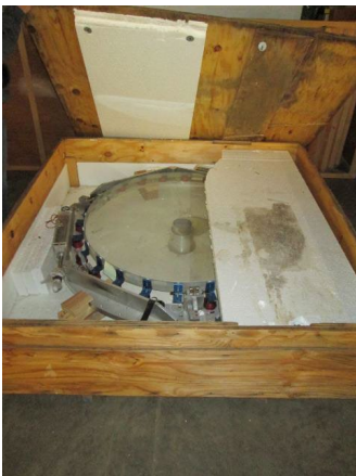
LOT 198 _____