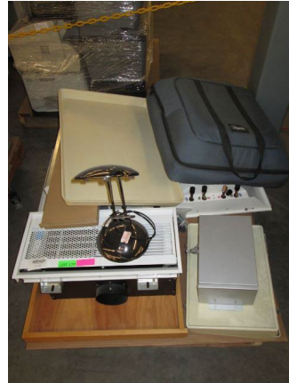
LOT 131 _____