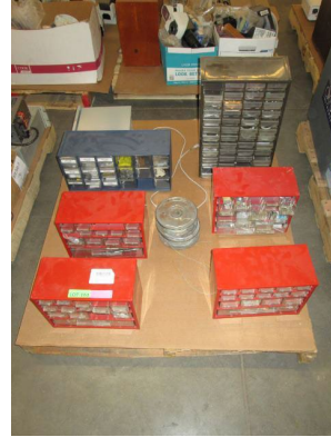
LOT 161 _____