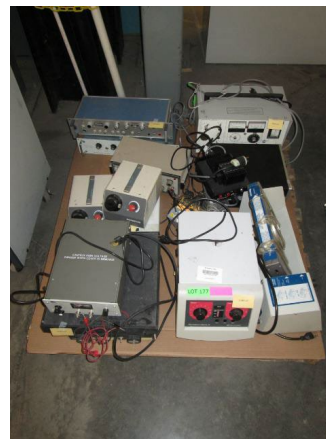
LOT 177 _____