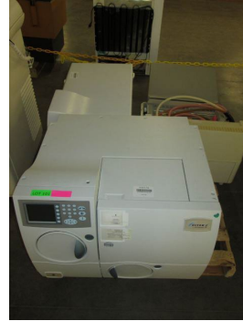
LOT 101 _____