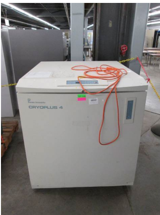
LOT 194 _____