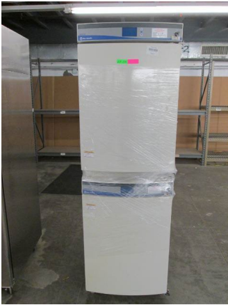
LOT 204 _____

Bids will be assessed the applicable Sales Tax unless a valid Resale License is provided. Please Print: