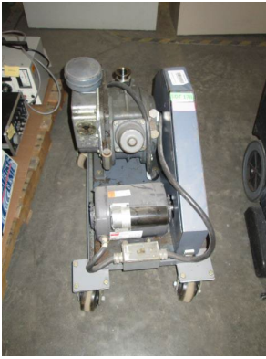
LOT 178 _____