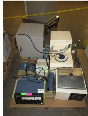
LOT 103 _____