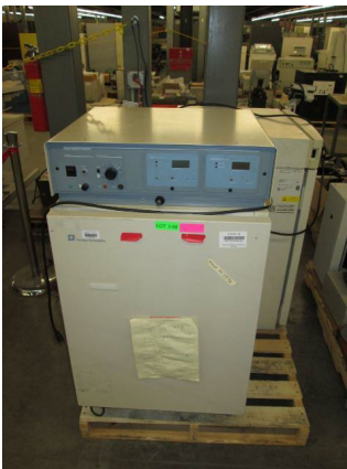
LOT 108 _____