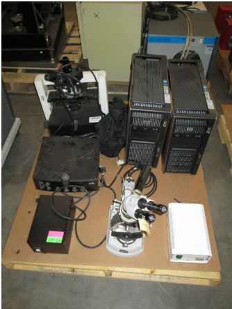
LOT 136 _____