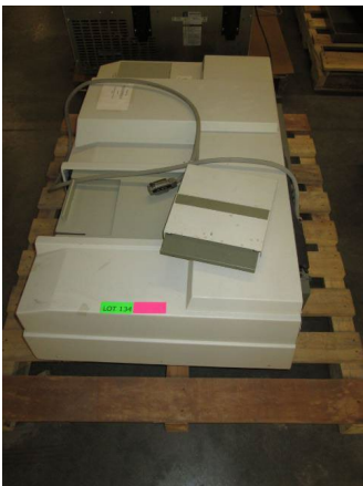
LOT 134 _____