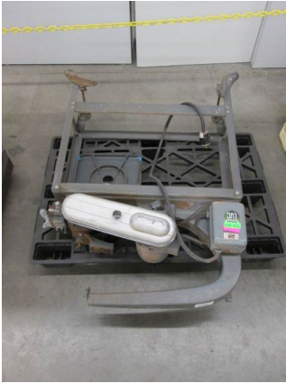
LOT 192 _____