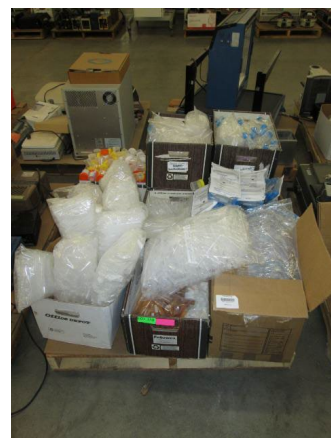
LOT 159 _____