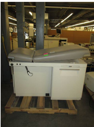
LOT 116 _____