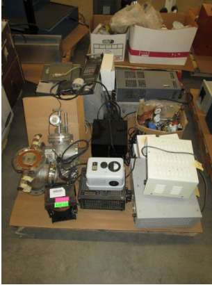
LOT 160 _____