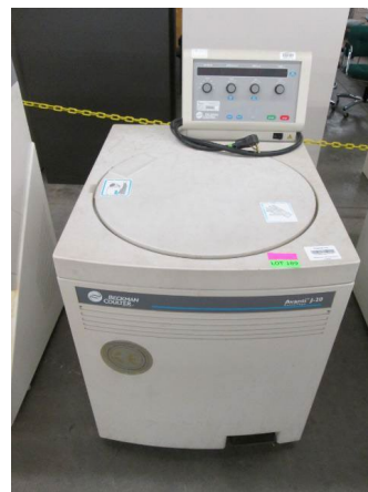
LOT 189 _____