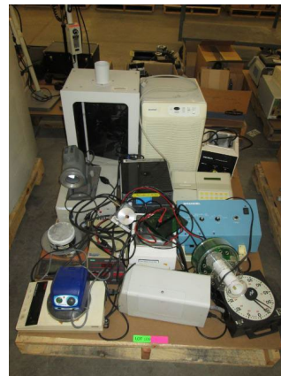
LOT 109 _____