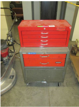
LOT 186 _____