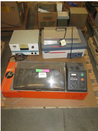
LOT 140 _____