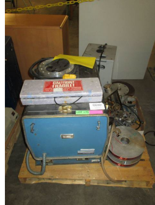
LOT 175 _____