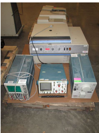
LOT 164 _____