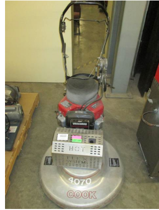
LOT 185 _____