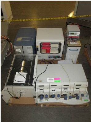
LOT 102 _____