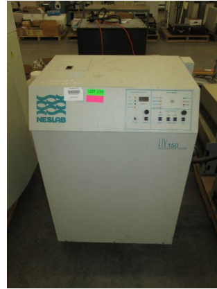
LOT 155 _____