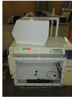
LOT 107 _____