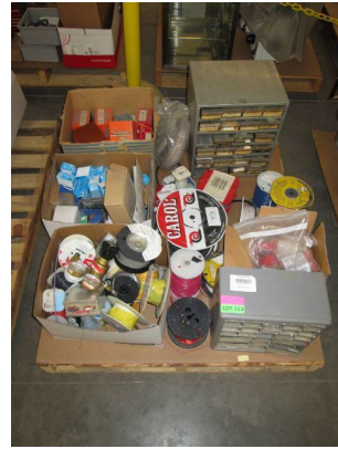
LOT 113 _____