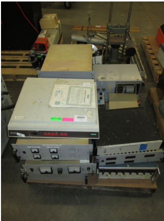
LOT 156 _____