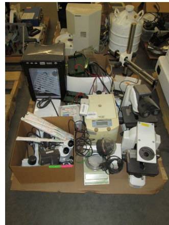
LOT 145 _____