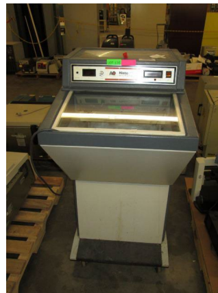
LOT 135 _____