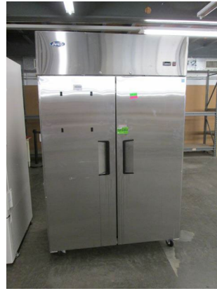
LOT 203 _____