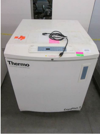
LOT 190 _____