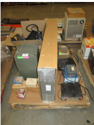
LOT 158 _____