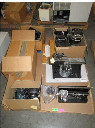
LOT 122 _____