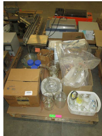
LOT 157 _____