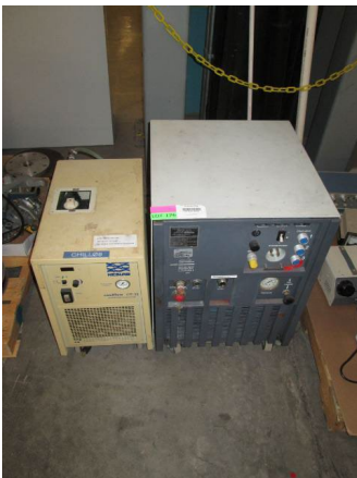
LOT 176 _____