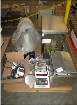
LOT 118 _____