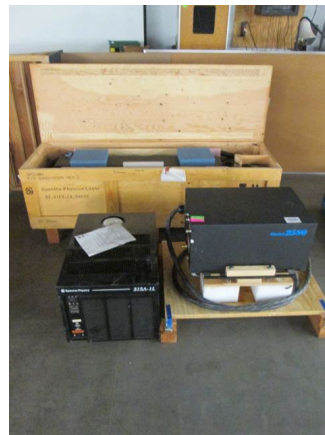
LOT 199 _____