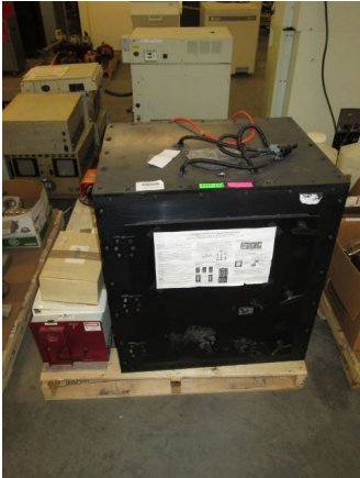
LOT 142 _____