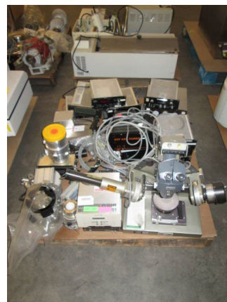
LOT 147 _____