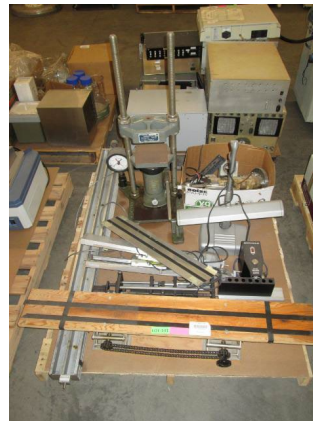
LOT 141 _____