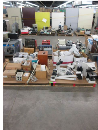
LOT 137 _____