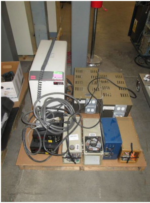
LOT 124 _____