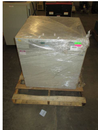
LOT 133 _____