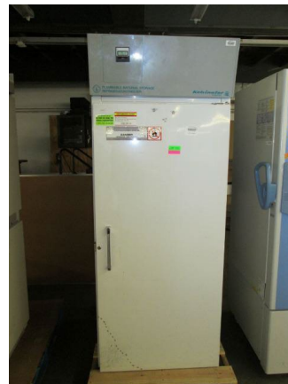
LOT 201 _____