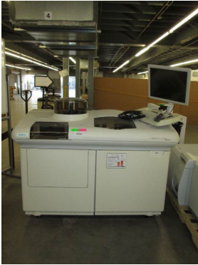
LOT 100 _____

***ONLY EVEN DOLLAR AMOUNTS WILL BE ACCEPTED NO CENTS PLEASE*