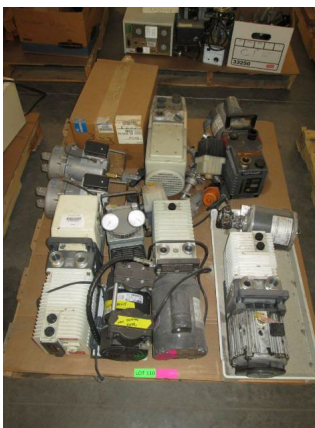
LOT 110 _____