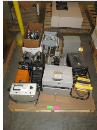
LOT 119 _____