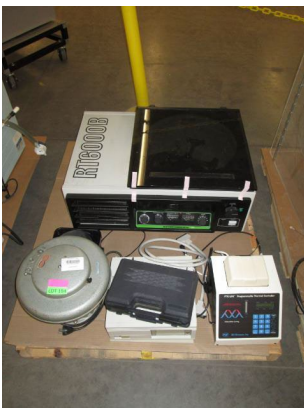
LOT 104 _____