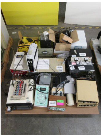
LOT 182 _____