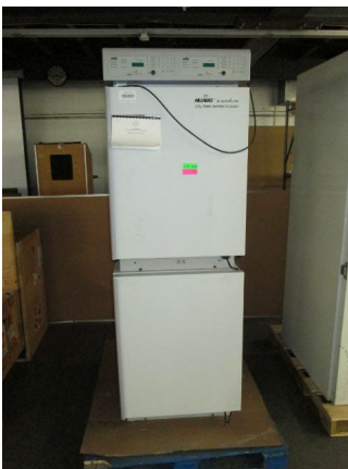
LOT 200 _____