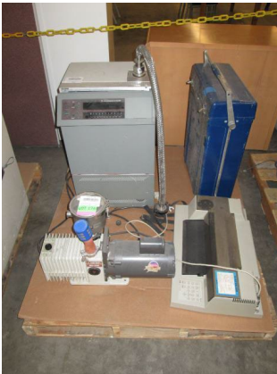
LOT 174 _____