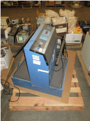
LOT 138 _____