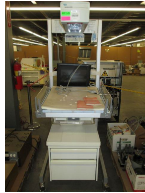
LOT 125 _____