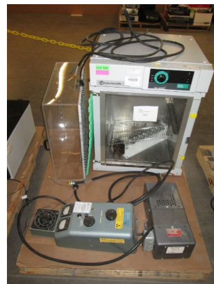
LOT 105 _____

January Lab Equipment & Supplies auction