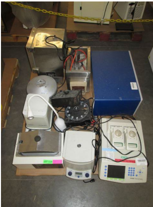
LOT 114 _____