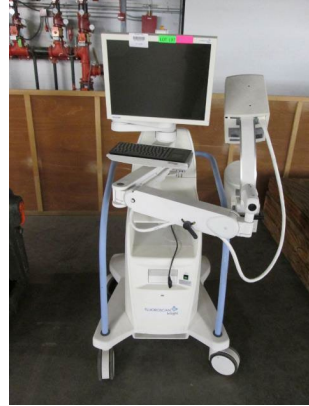
LOT 197 _____