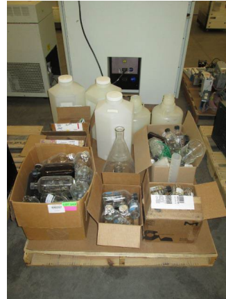
LOT 143 _____