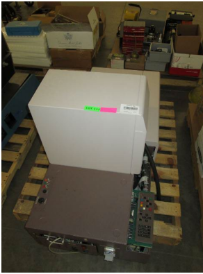
LOT 112 _____