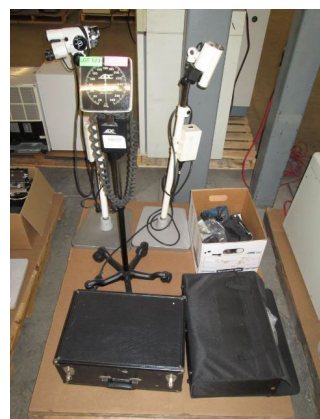
LOT 123 _____