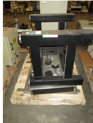
LOT 163 _____