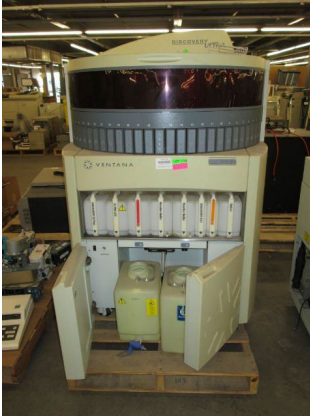
LOT 154 _____