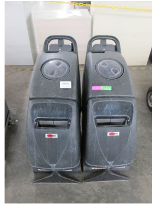
LOT 179 _____