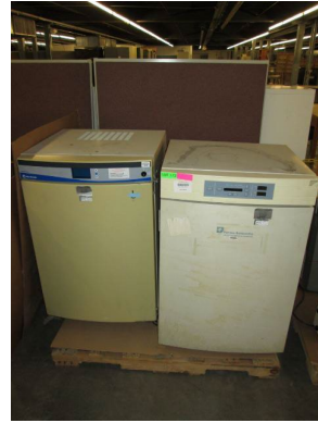
LOT 173 _____