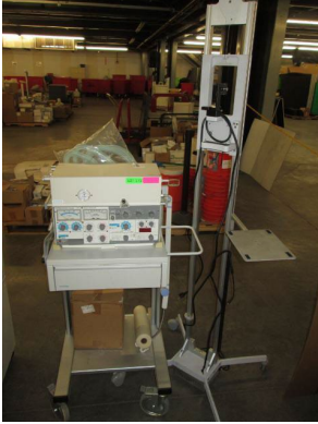
LOT 172 _____