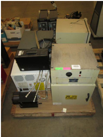
LOT 162 _____