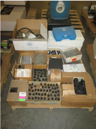
LOT 120 _____