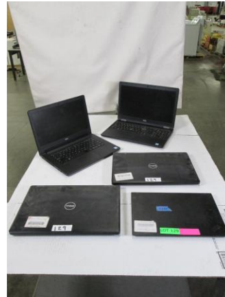
LOT 129 _____