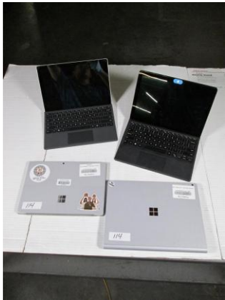
LOT 114 _____