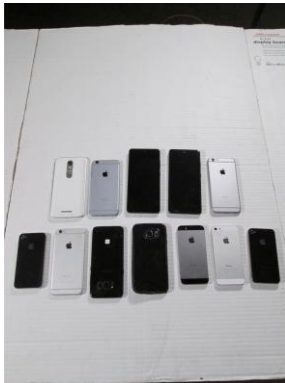
LOT 102 _____