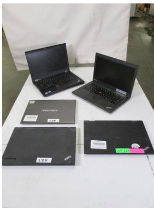
LOT 134 _____