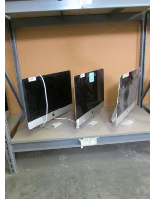
LOT 149 _____