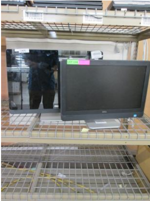
LOT 144 _____