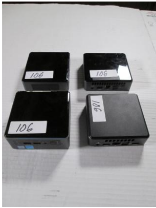
LOT 106 _____