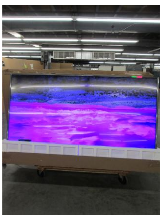
LOT 158 _____