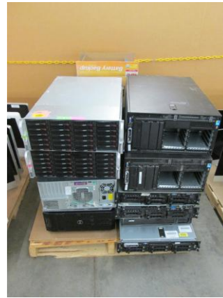
LOT 155 _____