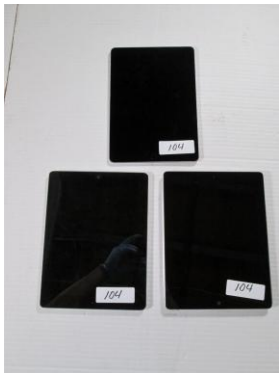
LOT 104 _____