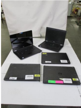
LOT 130 _____