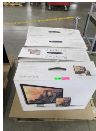
LOT 165 _____