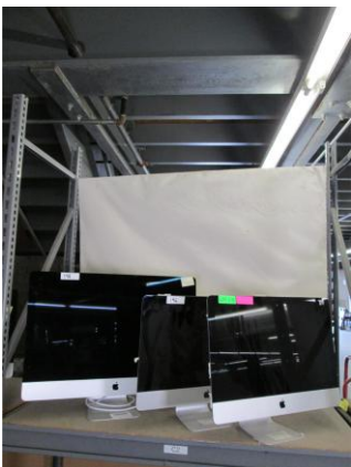
LOT 146 _____