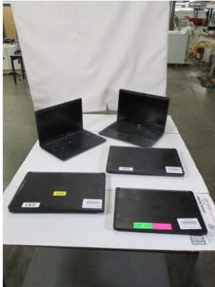
LOT 132 _____