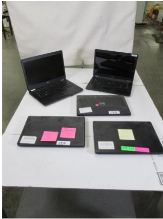
LOT 126 _____