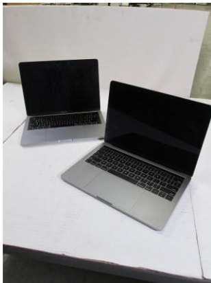
LOT 122 _____