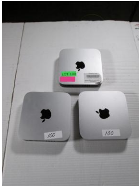
LOT 100 _____

***ONLY EVEN DOLLAR AMOUNTS WILL BE ACCEPTED NO CENTS PLEASE***