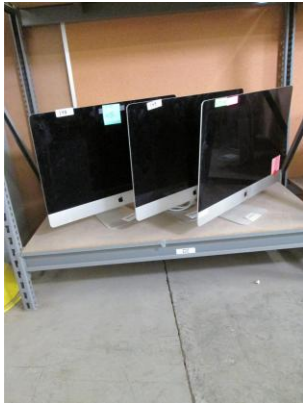
LOT 148 _____