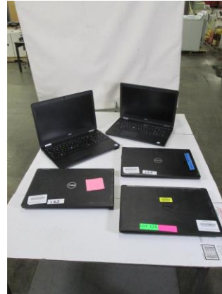
LOT 125 _____