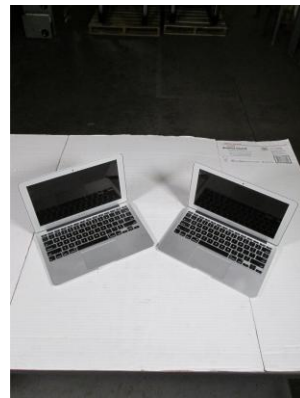
LOT 117 _____