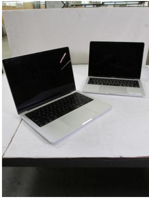
LOT 120 _____