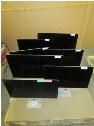
LOT 156 _____