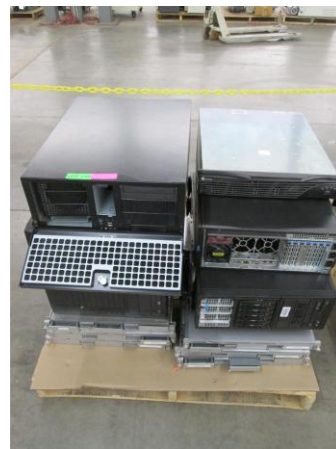
LOT 159 _____