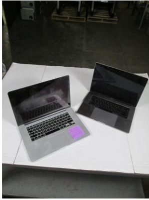
LOT 118 _____