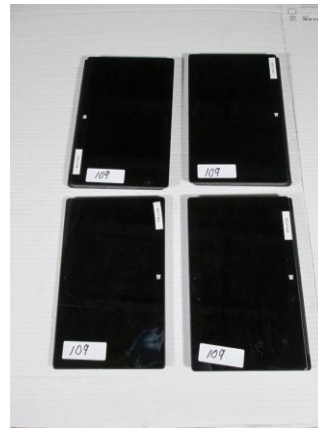
LOT 109 _____