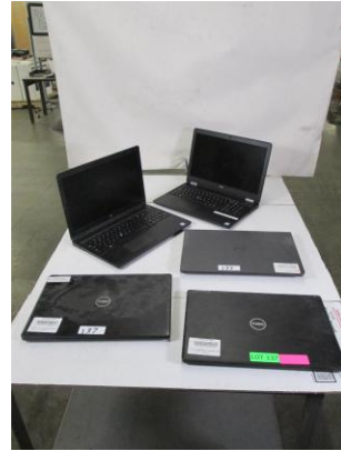
LOT 137 _____