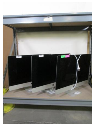
LOT 139 _____