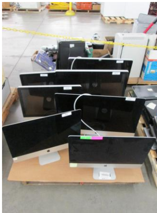
LOT 162 _____