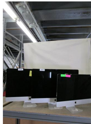
LOT 147 _____