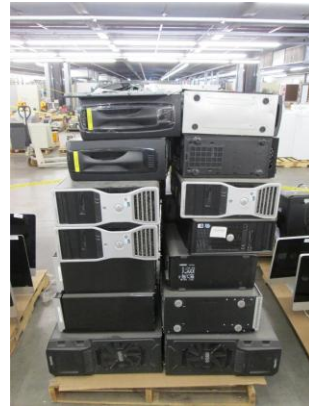
LOT 161 _____