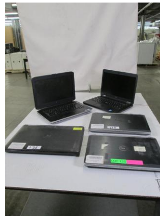
LOT 135 _____