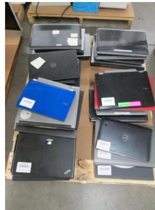
LOT 163 _____