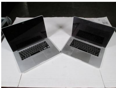
LOT 110 _____