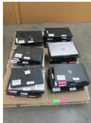
LOT 157 _____