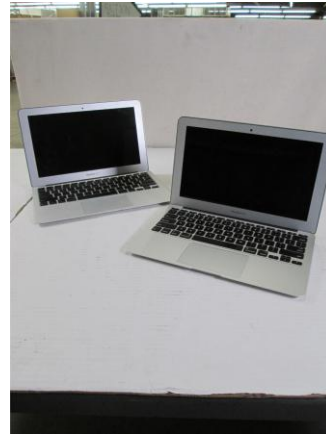
LOT 121 _____