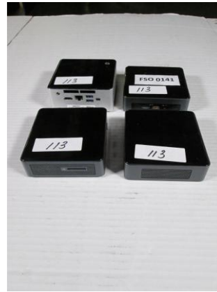
LOT 113 _____