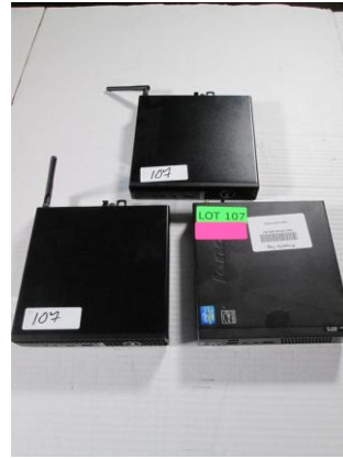
LOT 107 _____