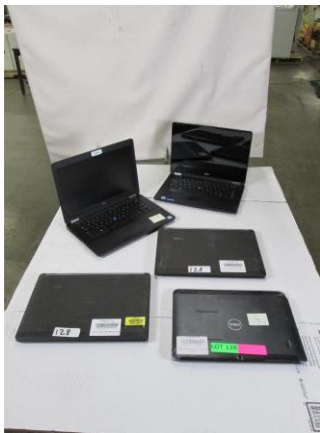
LOT 128 _____