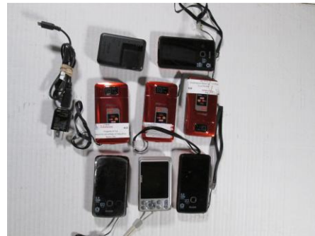
LOT 103 _____