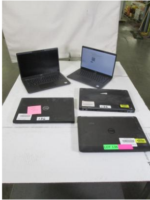
LOT 136 _____