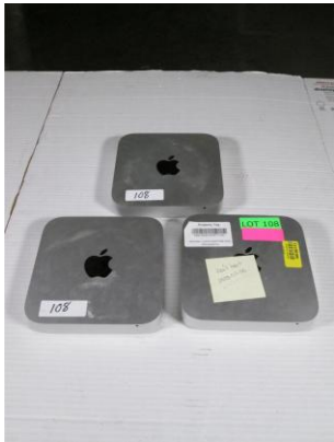
LOT 108 _____