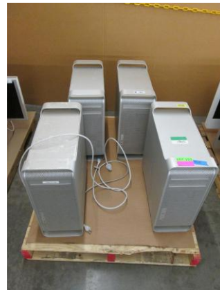
LOT 153 _____