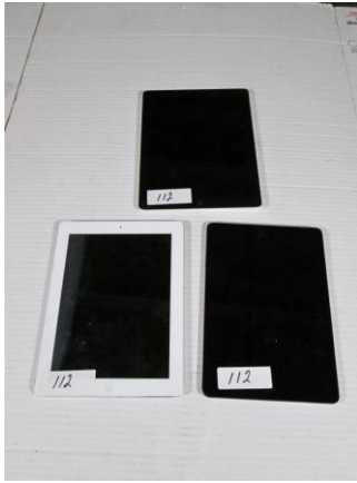
LOT 112 _____