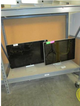
LOT 150 _____