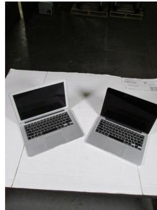
LOT 115 _____