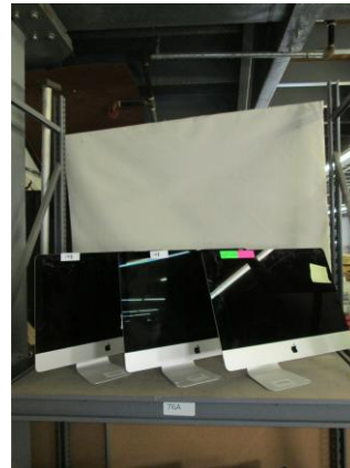
LOT 145 _____