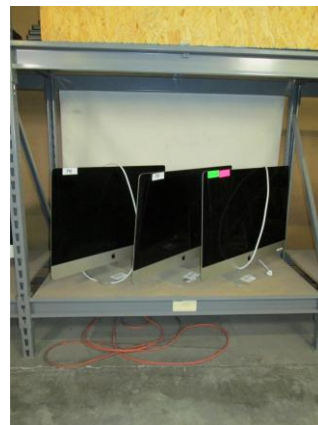
LOT 141 _____