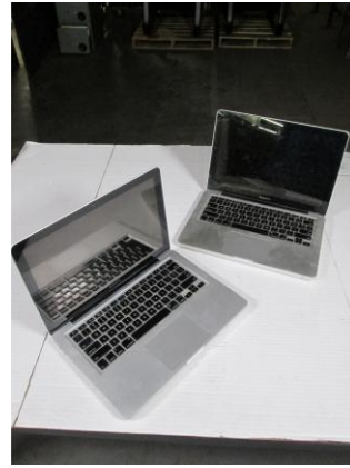
LOT 119 _____