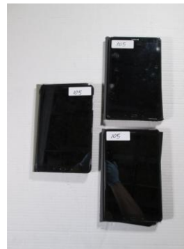
LOT 105 _____