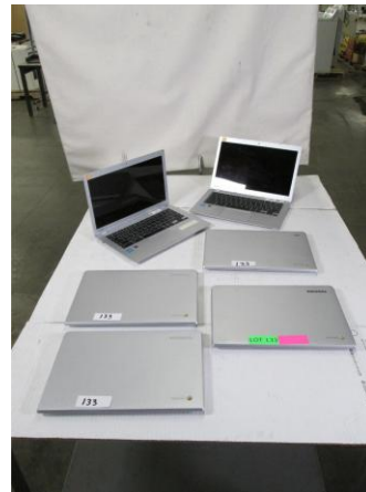
LOT 133 _____