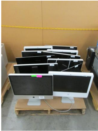
LOT 154 _____