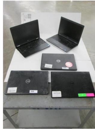
LOT 143 _____