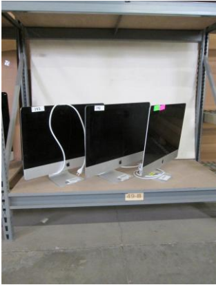
LOT 142 _____