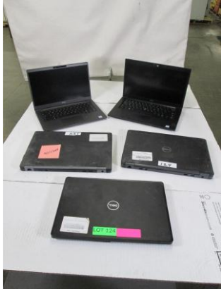
LOT 124 _____