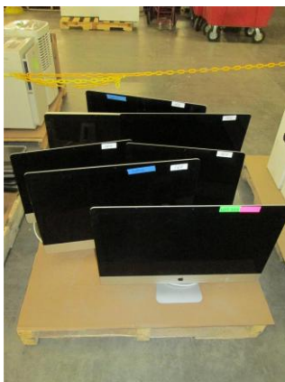
LOT 164 _____