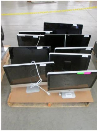
LOT 160 _____