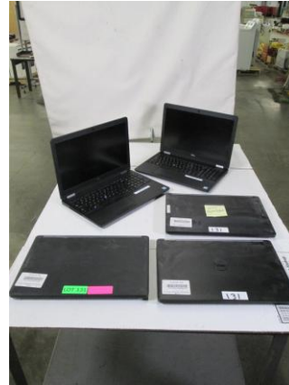
LOT 131 _____