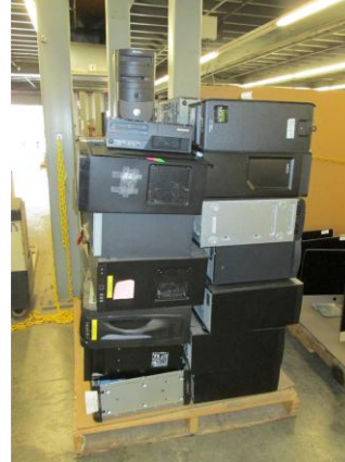
LOT 151 _____