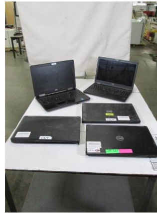
LOT 127 _____