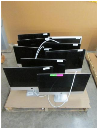
LOT 152 _____