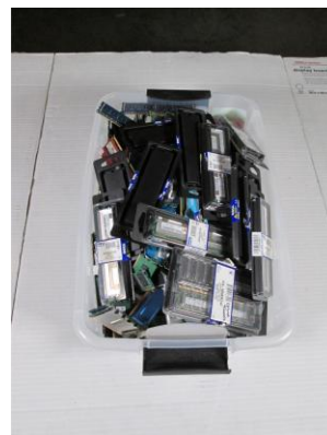
LOT 111 _____