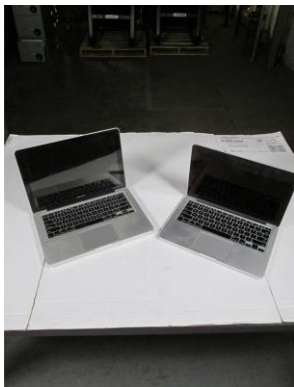
LOT 116 _____