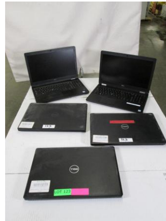
LOT 123 _____