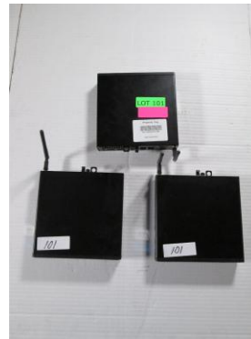
LOT 101 _____