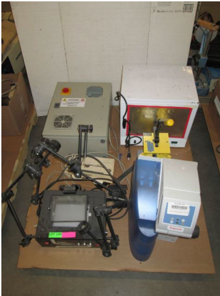
LOT 144 _____