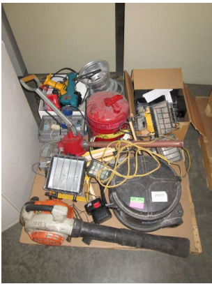
LOT 162 _____