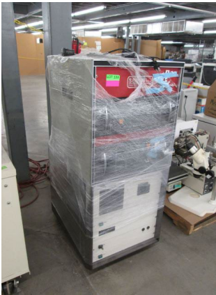
LOT 108 _____