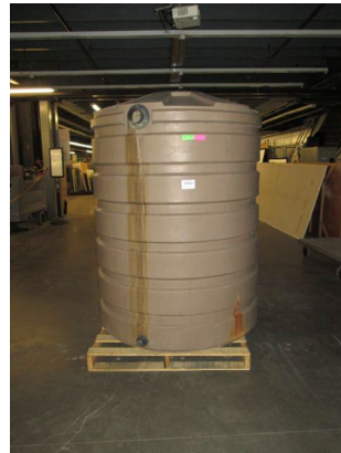
LOT 183 _____