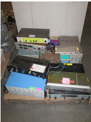
LOT 146 _____