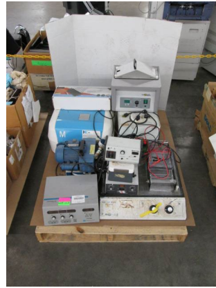
LOT 113 _____