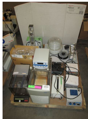
LOT 139 _____