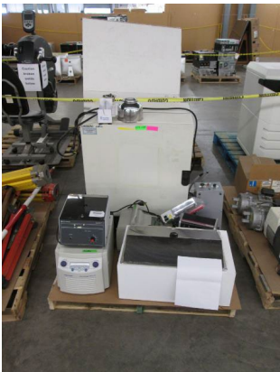
LOT 104 _____