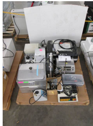
LOT 111 _____