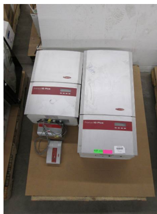
LOT 123 _____