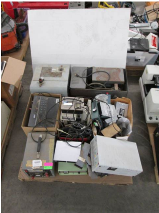
LOT 126 _____