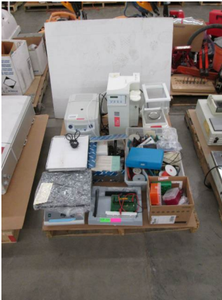
LOT 124 _____