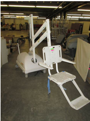
LOT 182 _____