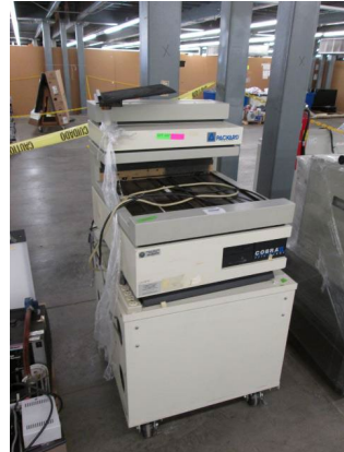
LOT 107 _____