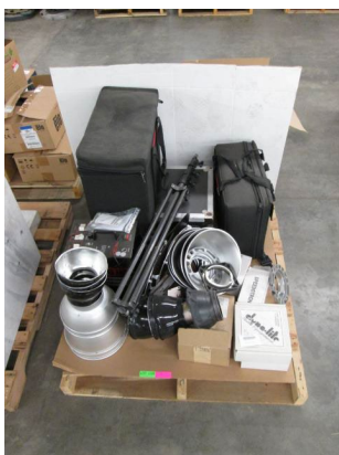
LOT 118 _____