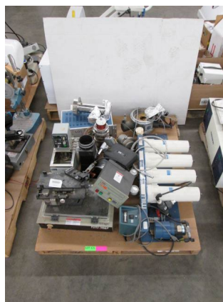
LOT 121 _____