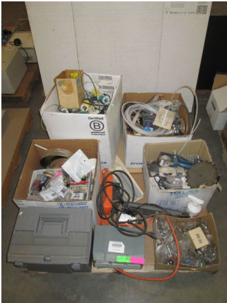
LOT 142 _____