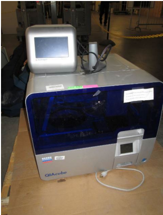
LOT 132 _____