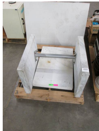
LOT 117 _____