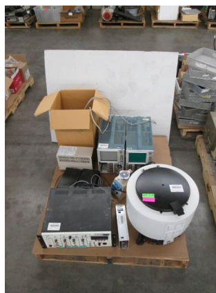
LOT 119 _____