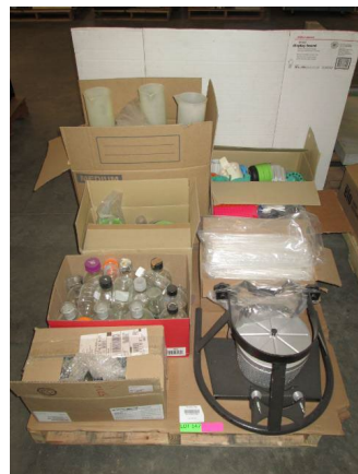
LOT 147 _____