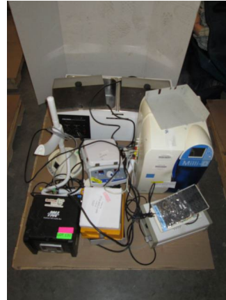
LOT 131 _____