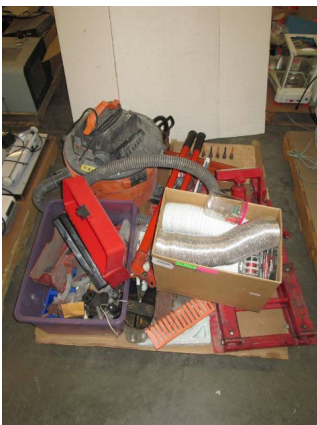
LOT 140 _____