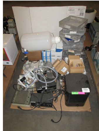
LOT 145 _____