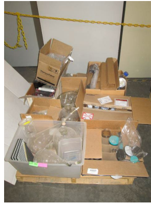
LOT 161 _____