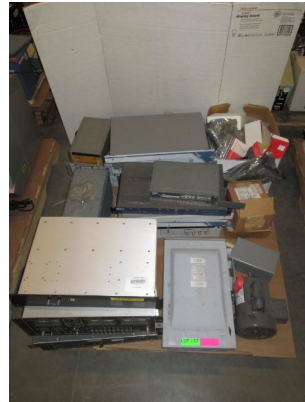
LOT 137 _____