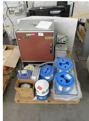
LOT 115 _____