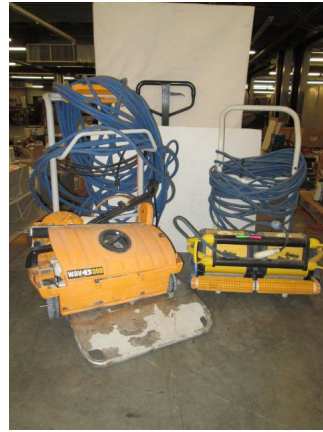
LOT 179 _____