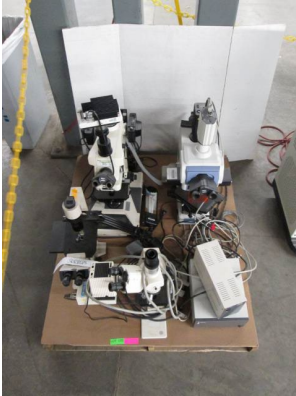
LOT 100 _____

***ONLY EVEN DOLLAR AMOUNTS WILL BE ACCEPTED NO CENTS PLEASE*