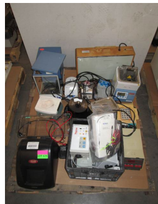
LOT 129 _____