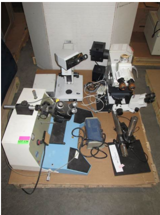
LOT 134 _____