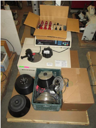
LOT 130 _____