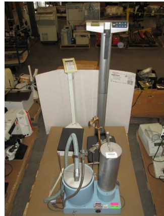
LOT 135 _____