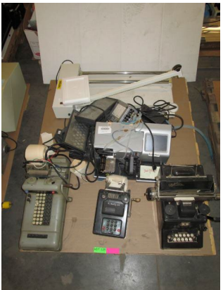
LOT 128 _____