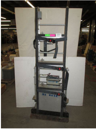
LOT 178 _____