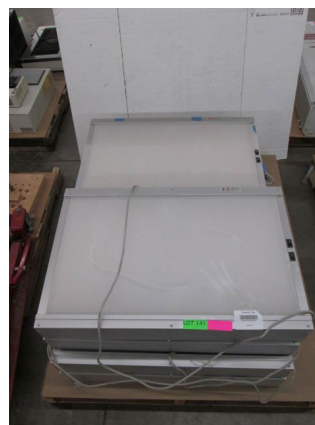
LOT 141 _____