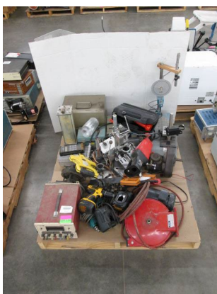
LOT 120 _____