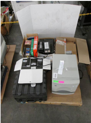
LOT 114 _____