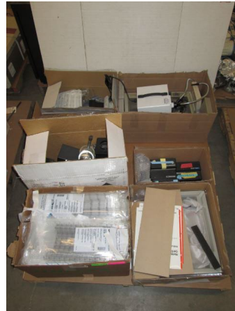
LOT 143 _____