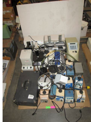
LOT 127 _____