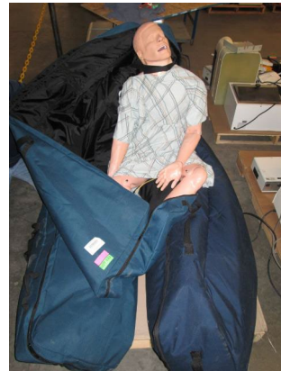
LOT 133 _____