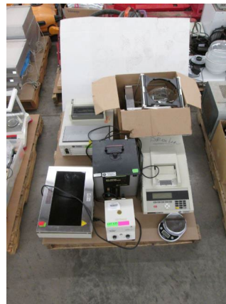
LOT 125 _____