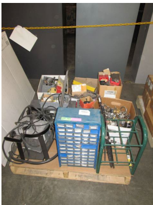
LOT 164 _____