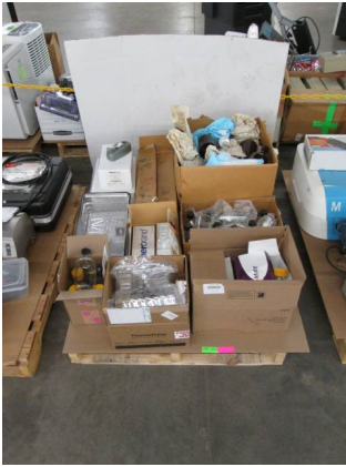
LOT 112 _____