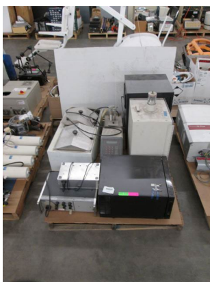
LOT 122 _____