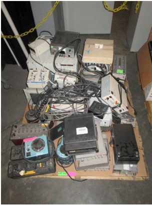
LOT 160 _____