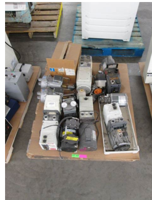
LOT 105 _____