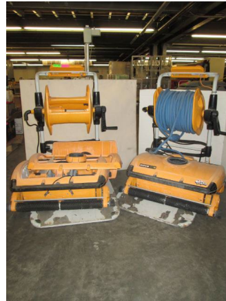
LOT 181 _____