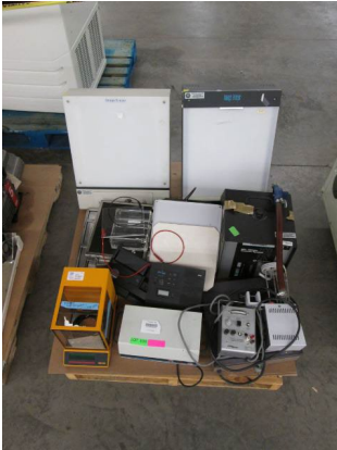
LOT 106 _____