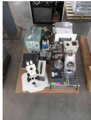
LOT 109 _____