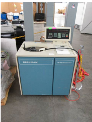
LOT 116 _____