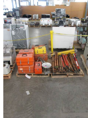
LOT 103 _____