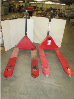
LOT 180 _____