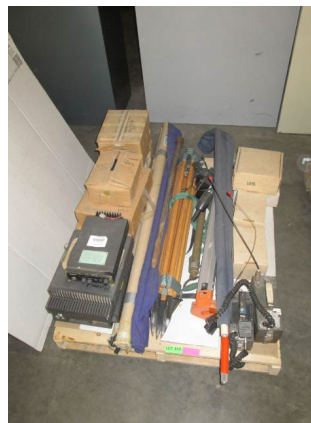
LOT 165 _____