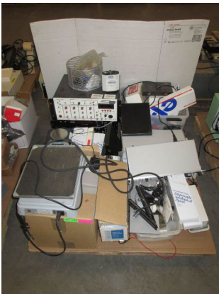
LOT 138 _____