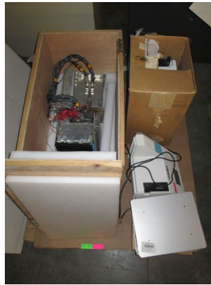
LOT 163 _____