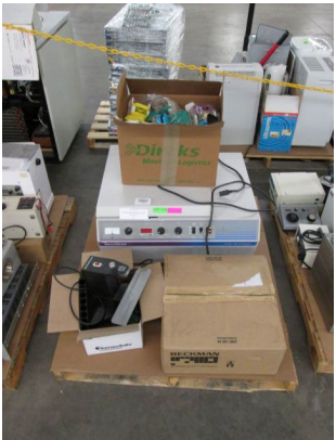
LOT 110 _____