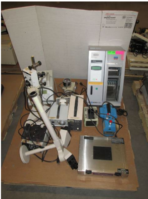
LOT 136 _____