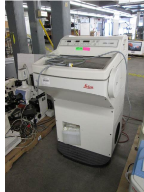
LOT 101 _____