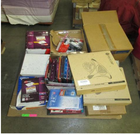
LOT 118 _____