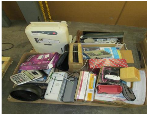
LOT 109 _____