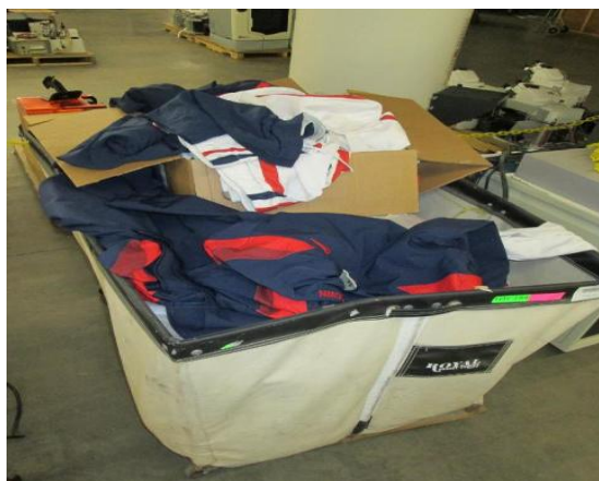
LOT 164 _____