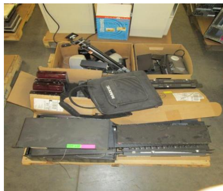
LOT 137 _____