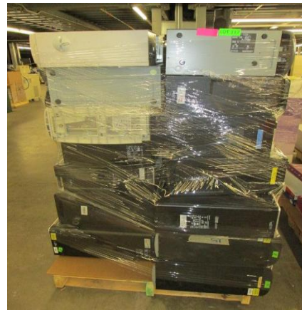
LOT 117 _____