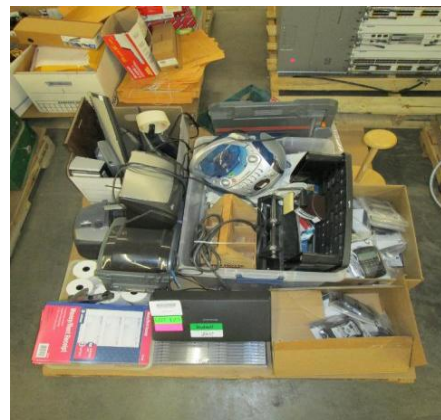
LOT 123 _____