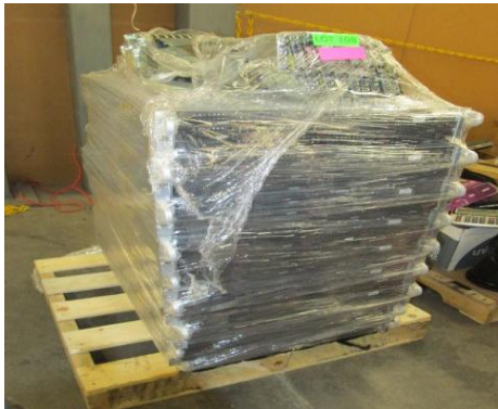
LOT 108 _____