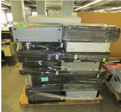
LOT 100 _____

***ONLY EVEN DOLLAR AMOUNTS WILL BE ACCEPTED NO CENTS PLEASE***