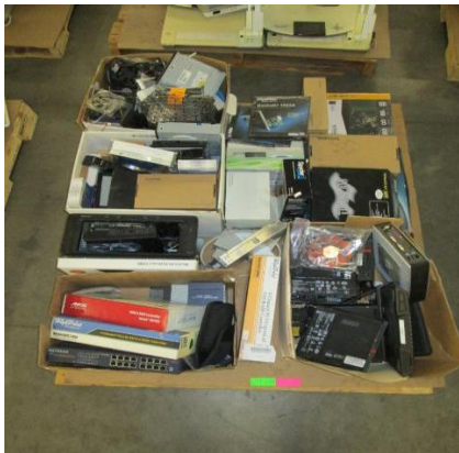
LOT 130 _____