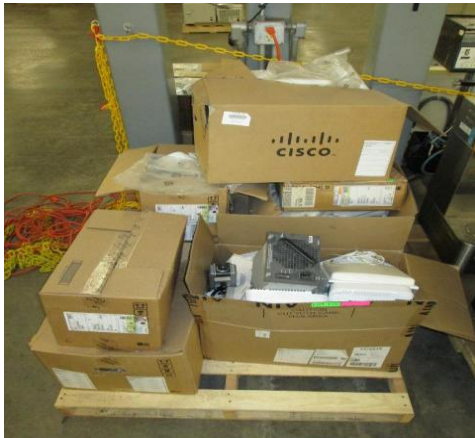
LOT 150 _____