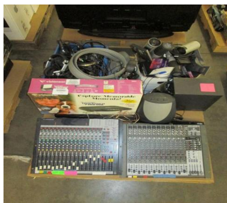
LOT 134 _____