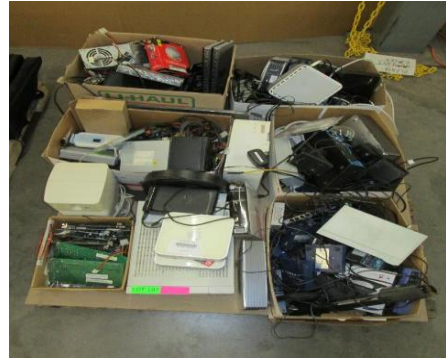
LOT 107 _____