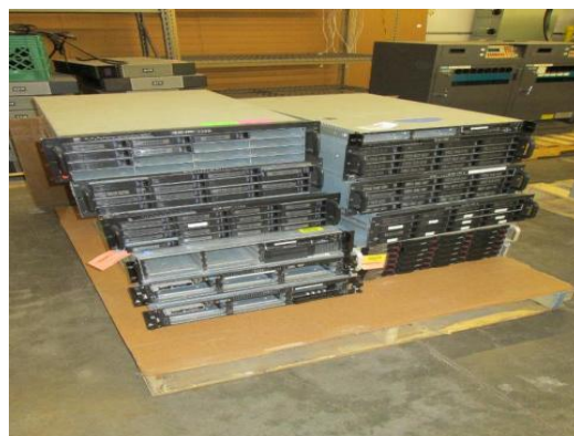
LOT 171 _____