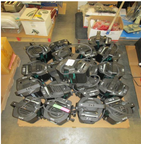
LOT 120 _____