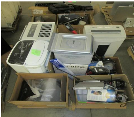
LOT 128 _____