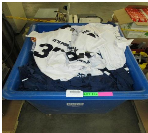
LOT 152 _____