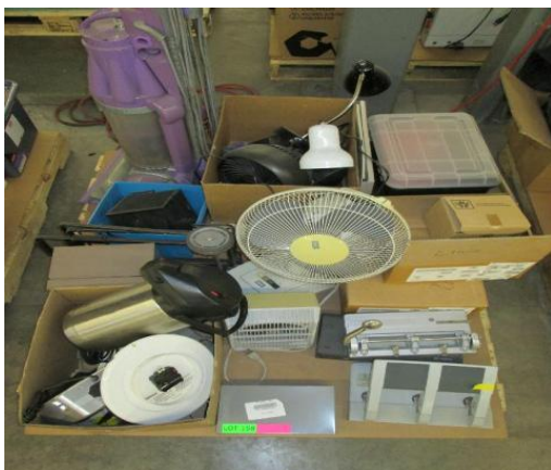
LOT 158 _____