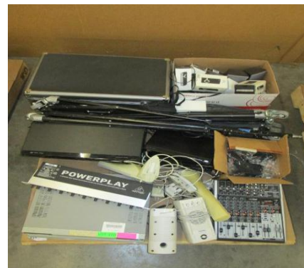
LOT 105 _____