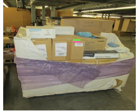
LOT 149 _____