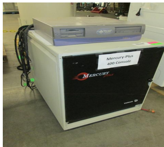
LOT 165 _____