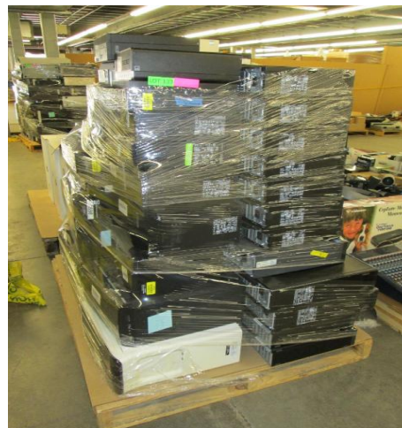
LOT 133 _____