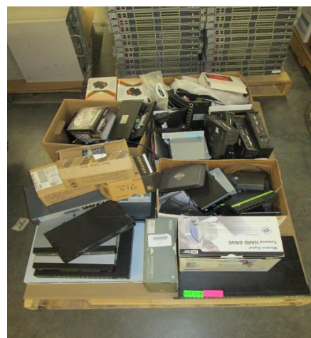
LOT 139 _____