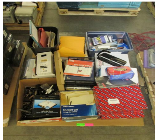
LOT 157 _____