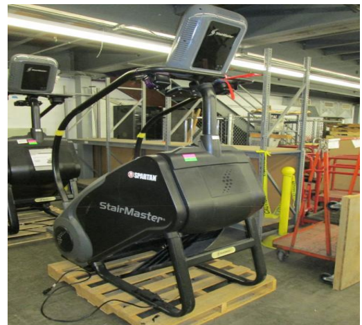
LOT 175 _____