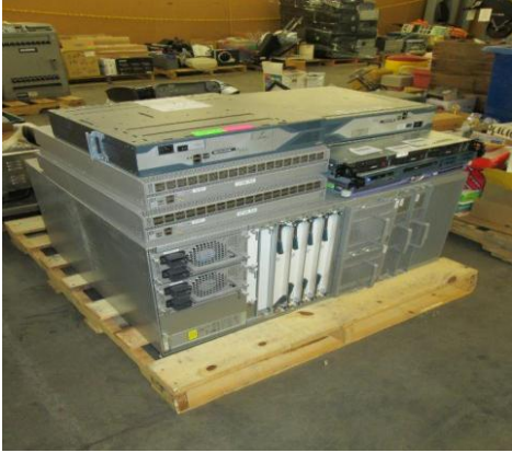
LOT 142 _____