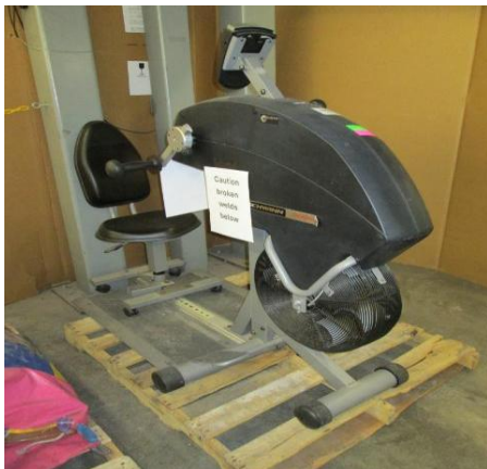
LOT 116 _____