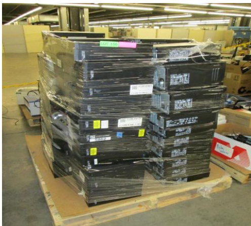
LOT 156 _____