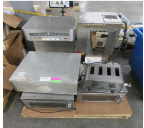
LOT 151 _____