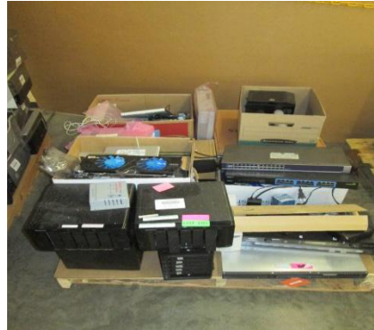
LOT 101 _____