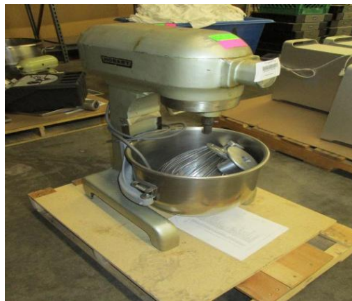
LOT 167 _____