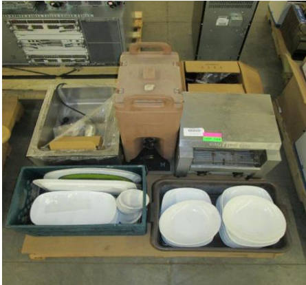
LOT 124 _____