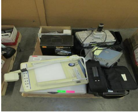
LOT 106 _____