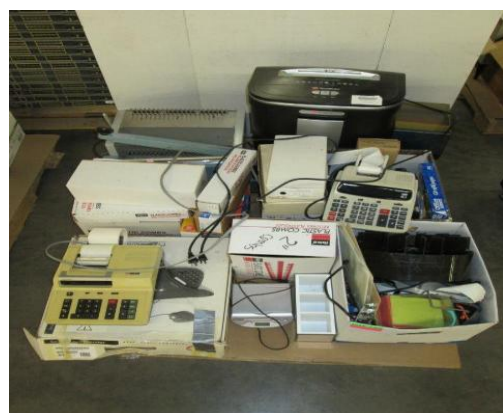
LOT 140 _____