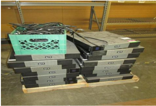
LOT 172 _____