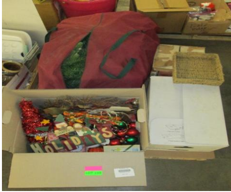
LOT 148 _____