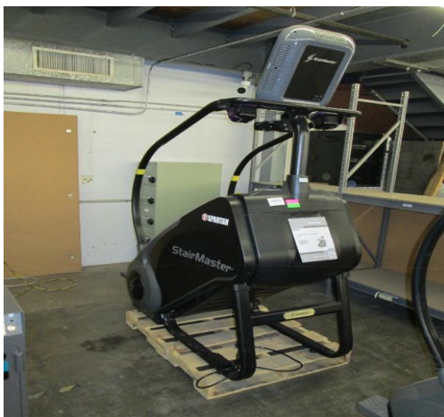
LOT 176 _____