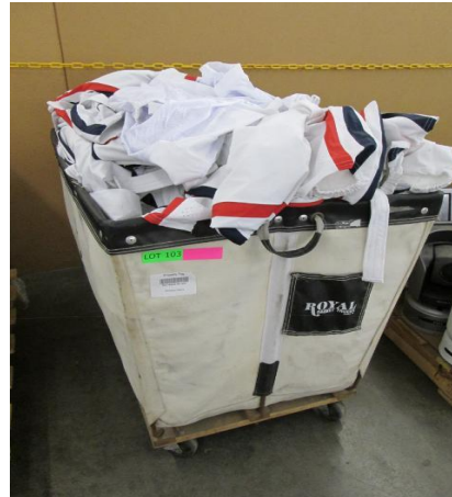
LOT 103 _____