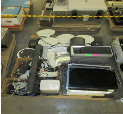
LOT 154 _____