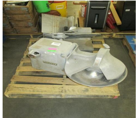
LOT 145 _____