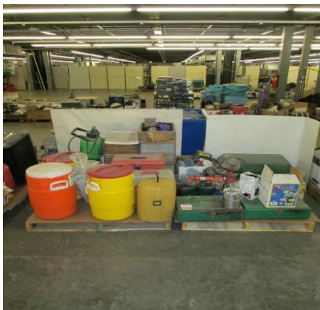
LOT 122 _____