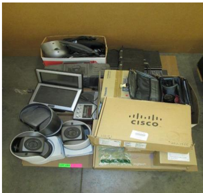
LOT 104 _____