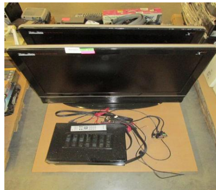
LOT 131 _____