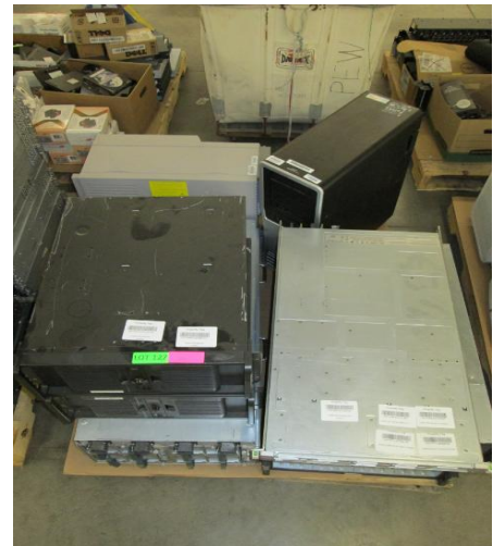
LOT 127 _____