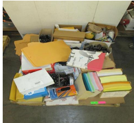
LOT 143 _____