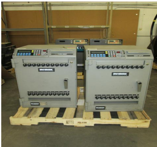
LOT 174 _____