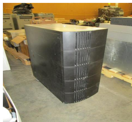
LOT 141 _____