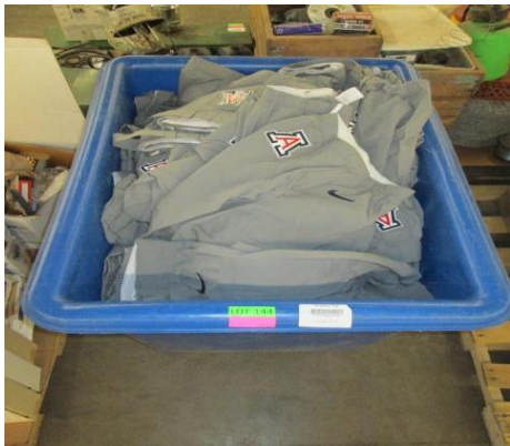
LOT 144 _____