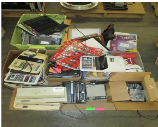
LOT 162 _____