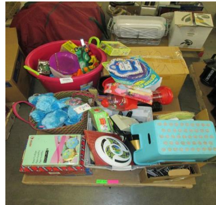
LOT 119 _____