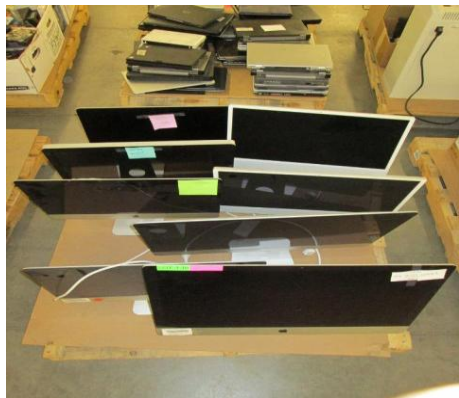
LOT 136 _____