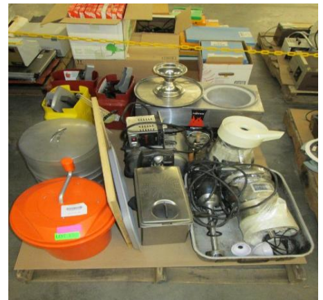
LOT 153 _____