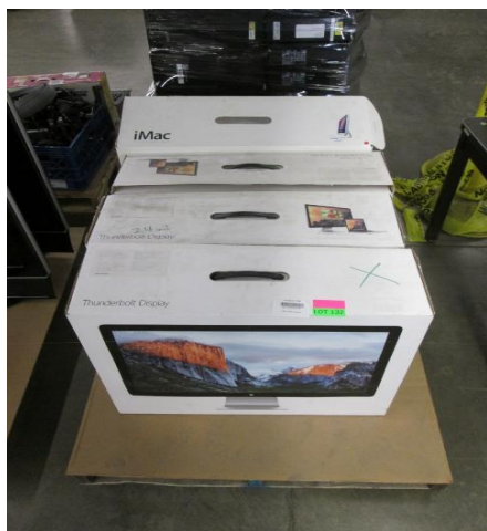
LOT 132 _____