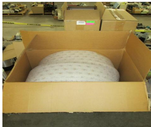
LOT 161 _____