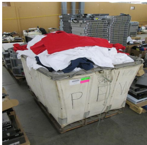
LOT 138 _____