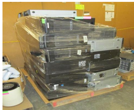
LOT 113 _____