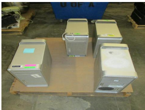
LOT 170 _____