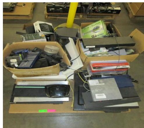
LOT 163 _____