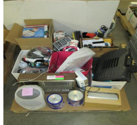
LOT 125 _____