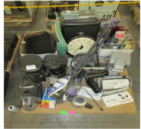
LOT 155 _____