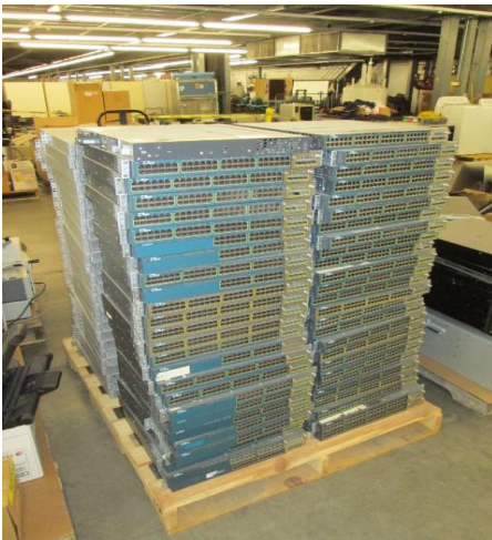
LOT 126 _____