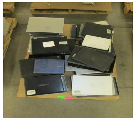
LOT 129 _____