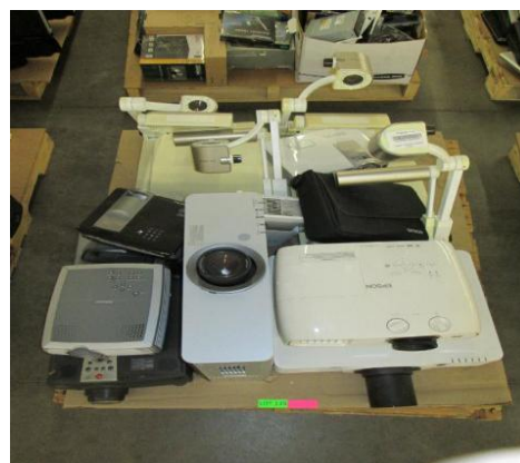
LOT 135 _____