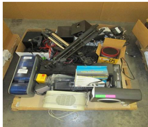
LOT 111 _____