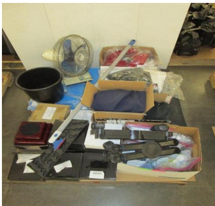
LOT 146 _____