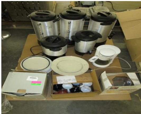
LOT 160 _____