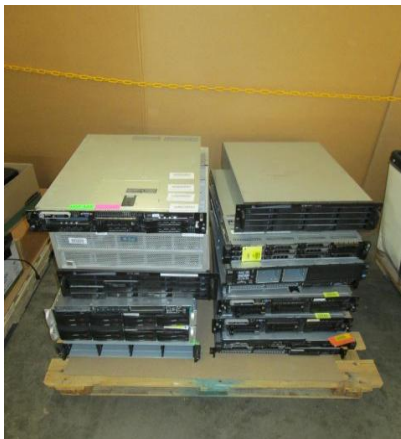
LOT 102 _____