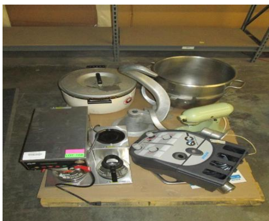
LOT 168 _____