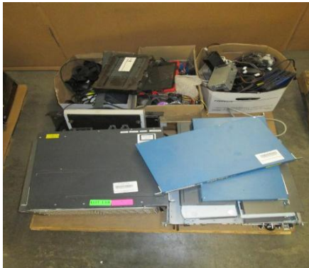
LOT 114 _____