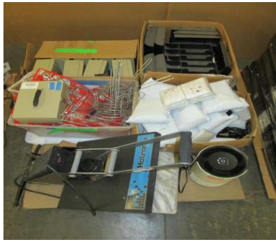
LOT 112 _____