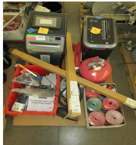
LOT 121 _____