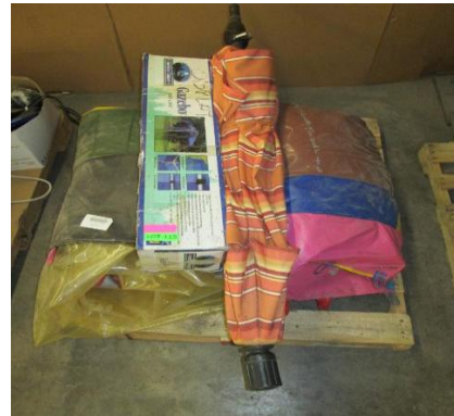
LOT 115 _____