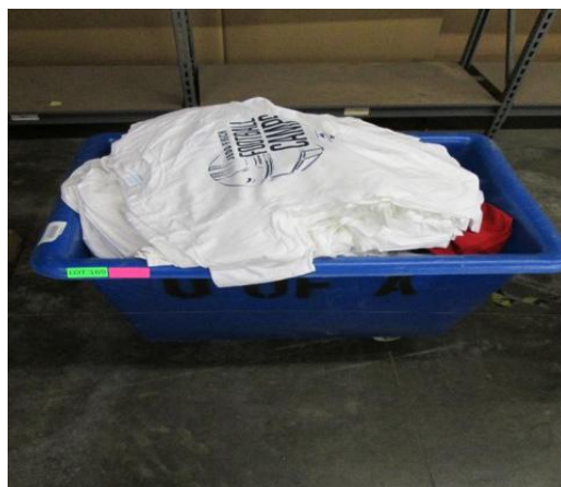
LOT 169 _____