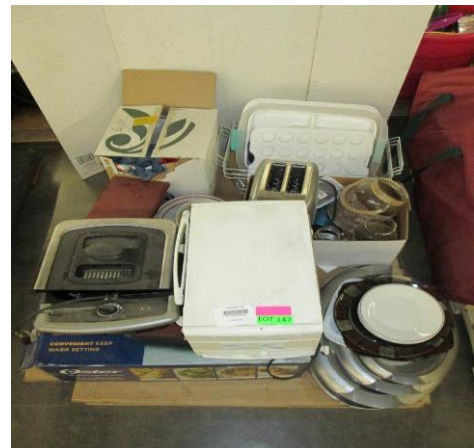
LOT 147 _____