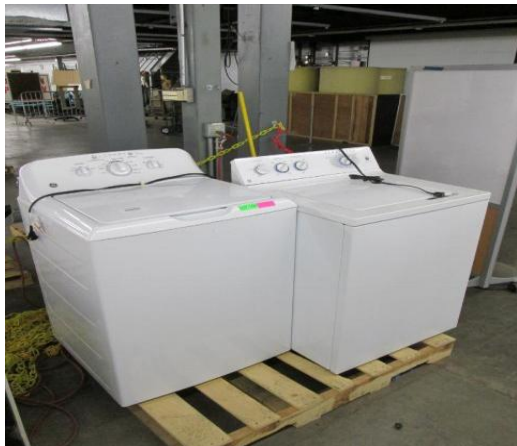
LOT 166 _____