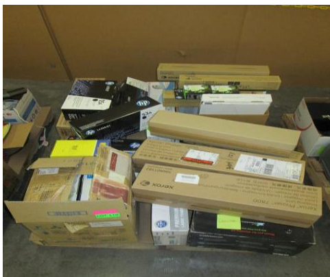
LOT 110 _____