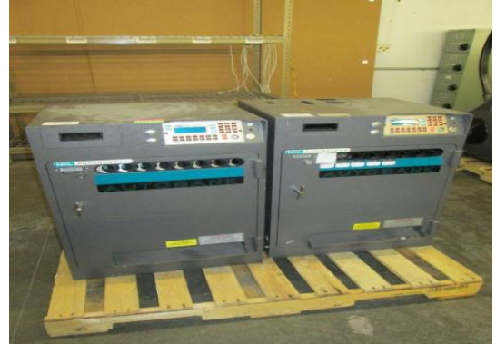
LOT 173 _____