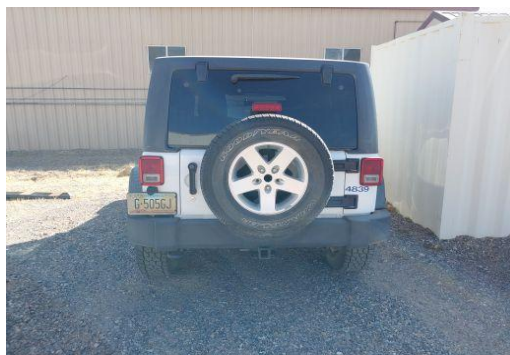
2012 Jeep Wrangler Sport 4X4