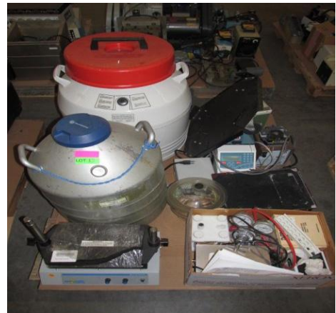
LOT 139 _____