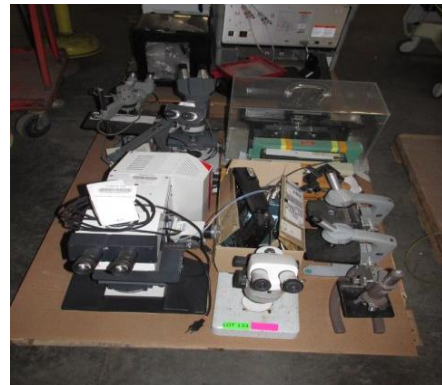
LOT 133 _____