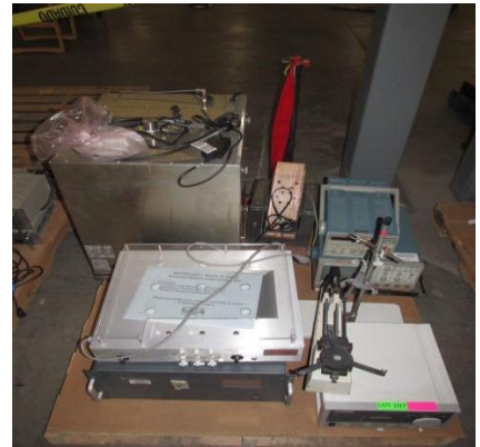
LOT 107 _____