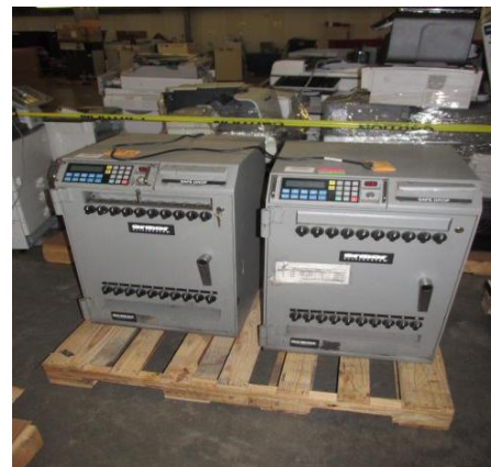
LOT 153 _____