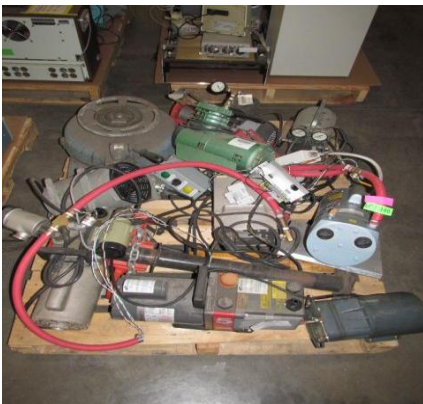
LOT 146 _____