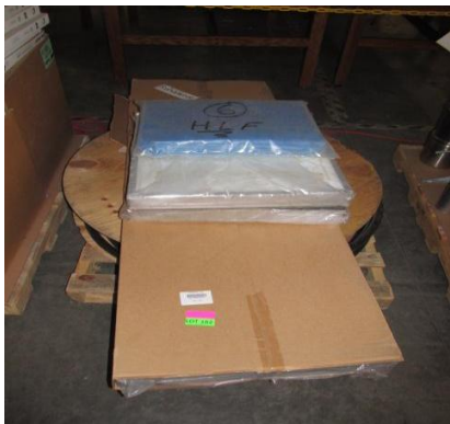
LOT 162 _____