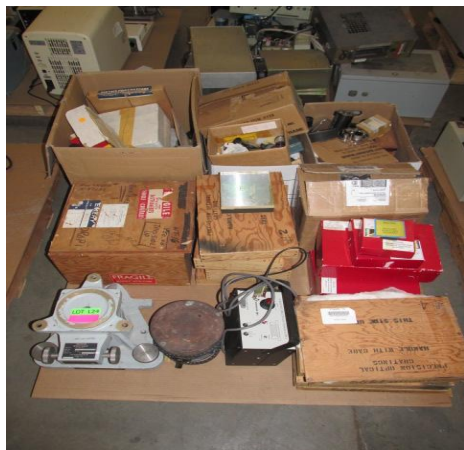
LOT 124 _____