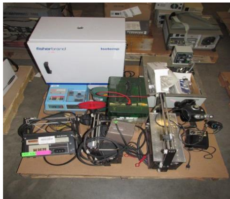
LOT 122 _____