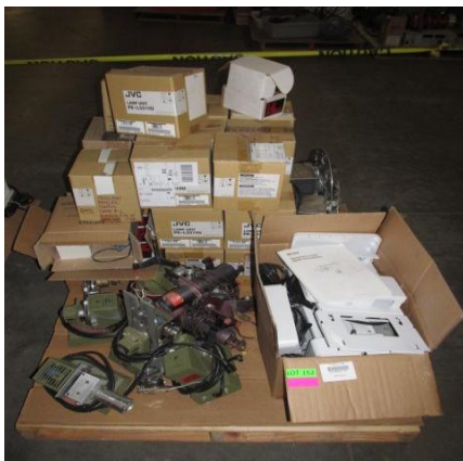
LOT 152 _____