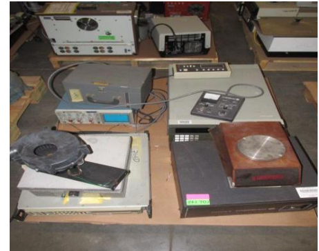
LOT 145 _____