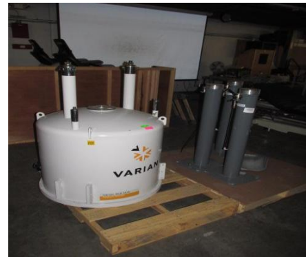
LOT 175 _____