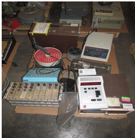
LOT 120 _____