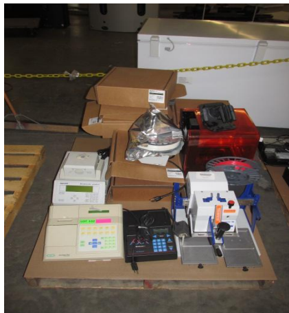
LOT 102 _____