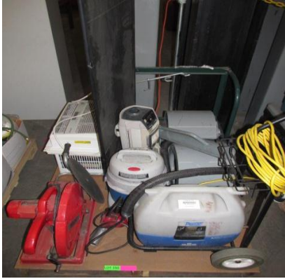
LOT 166 _____