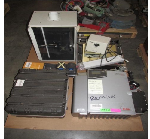
LOT 119 _____