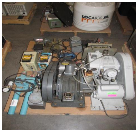
LOT 126 _____