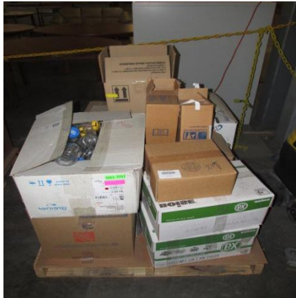
LOT 160 _____