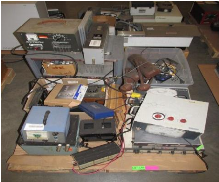
LOT 144 _____