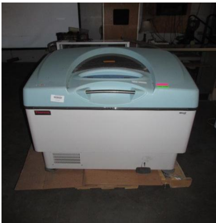
LOT 178 _____