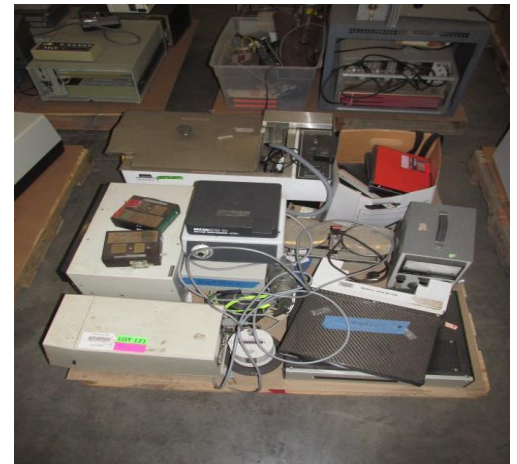
LOT 121 _____