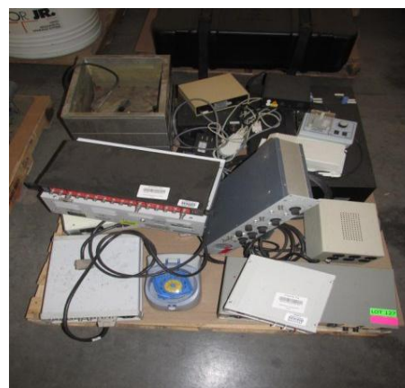
LOT 127 _____