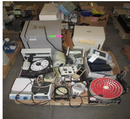
LOT 137 _____