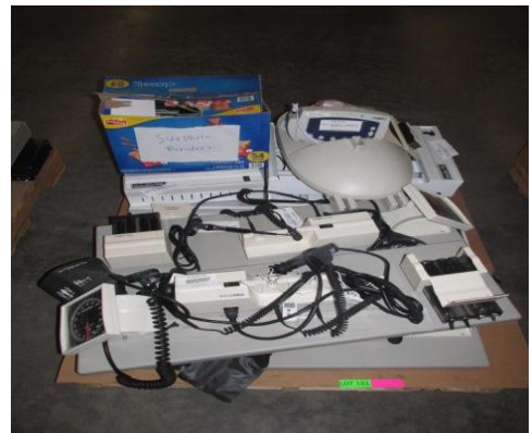
LOT 151 _____