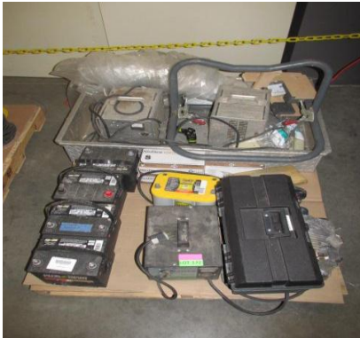
LOT 172 _____