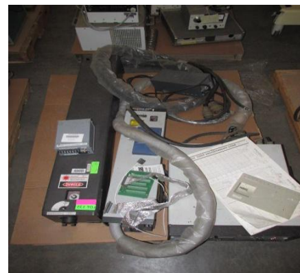
LOT 135 _____