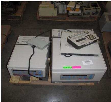
LOT 140 _____