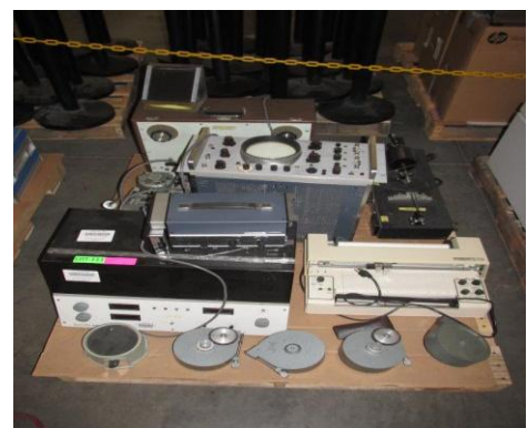
LOT 111 _____