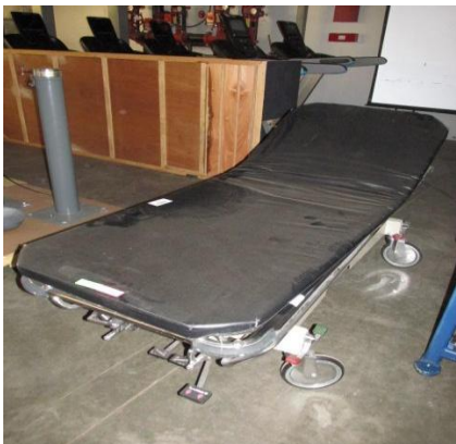
LOT 176 _____