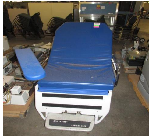
LOT 131 _____