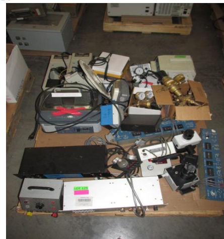
LOT 125 _____