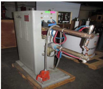
LOT 174 _____