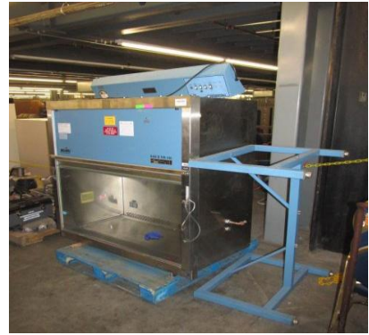
LOT 173 _____