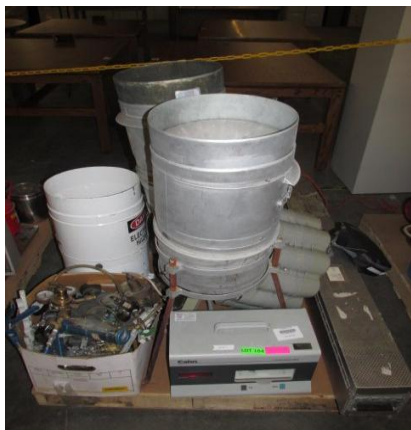
LOT 164 _____