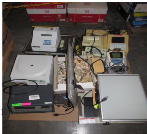
LOT 114 _____