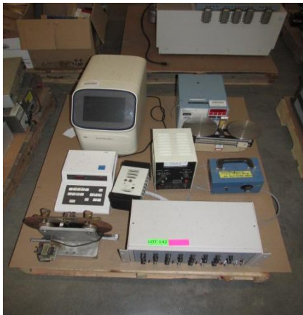
LOT 142 _____