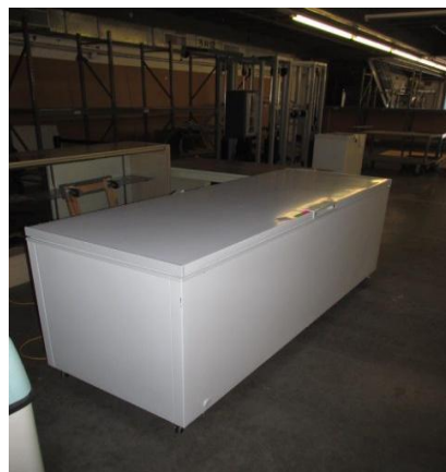
LOT 179 _____

Bids will be assessed the applicable Sales Tax unless a valid Resale License is provided.