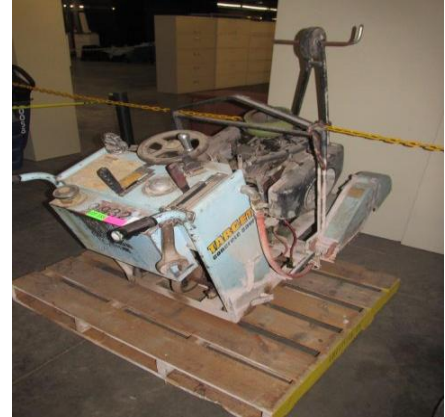
LOT 155 _____