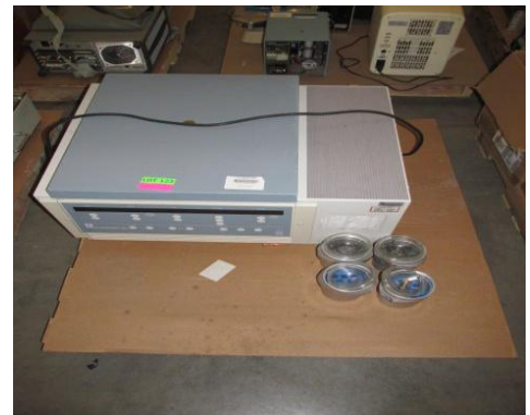
LOT 123 _____