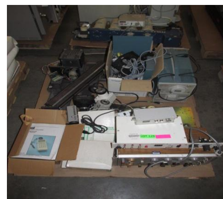
LOT 129 _____