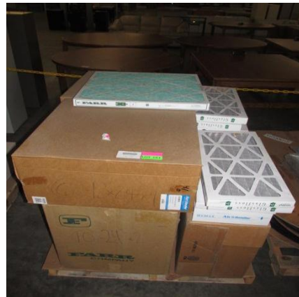
LOT 161 _____