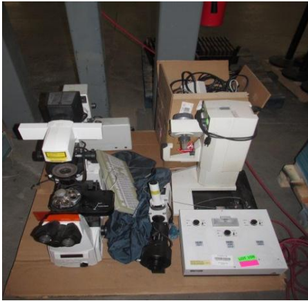
LOT 108 _____