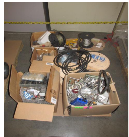
LOT 171 _____