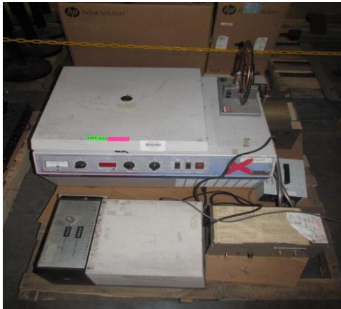
LOT 112 _____