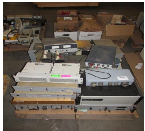
LOT 141 _____