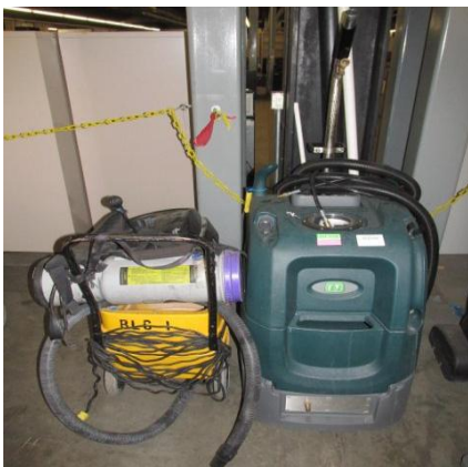
LOT 158 _____