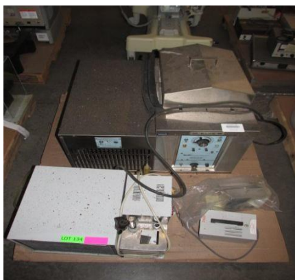
LOT 134 _____