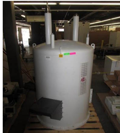
LOT 101 _____