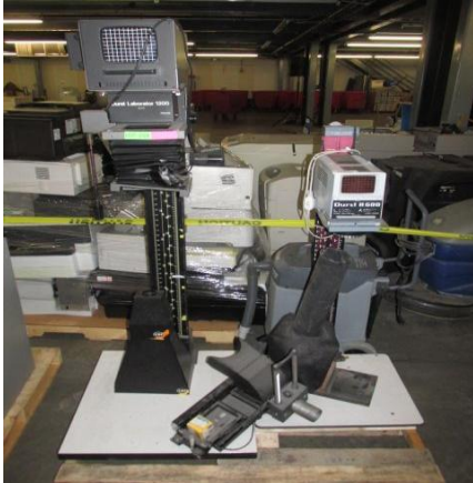
LOT 154 _____