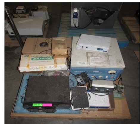
LOT 117 _____