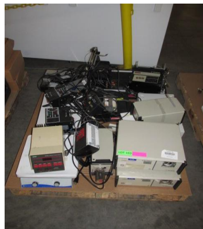
LOT 103 _____