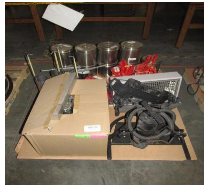
LOT 163 _____