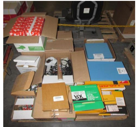
LOT 113 _____