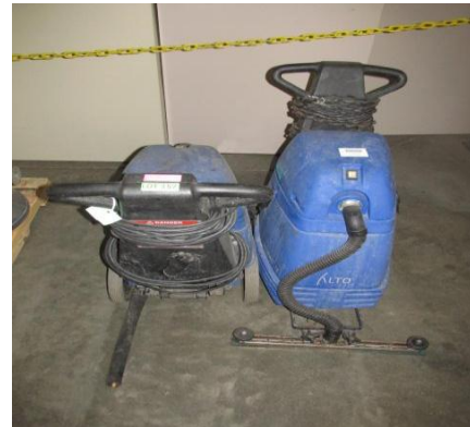
LOT 157 _____