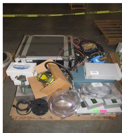
LOT 105 _____