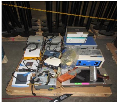
LOT 110 _____