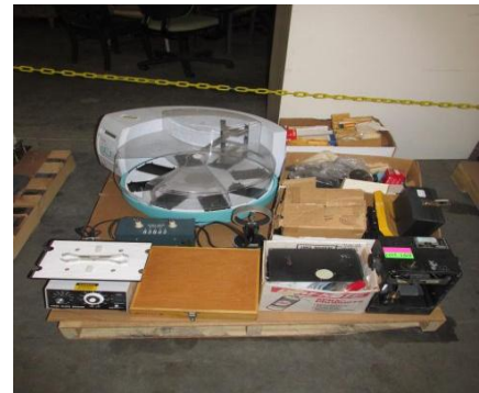
LOT 169 _____