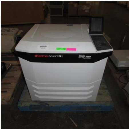
LOT 148 _____