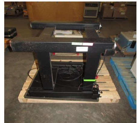
LOT 147 _____