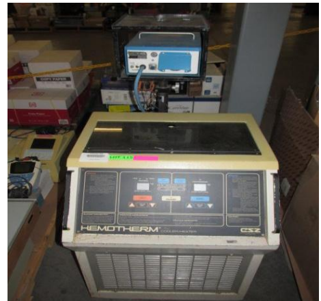
LOT 115 _____