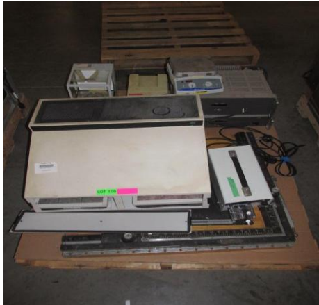
LOT 106 _____