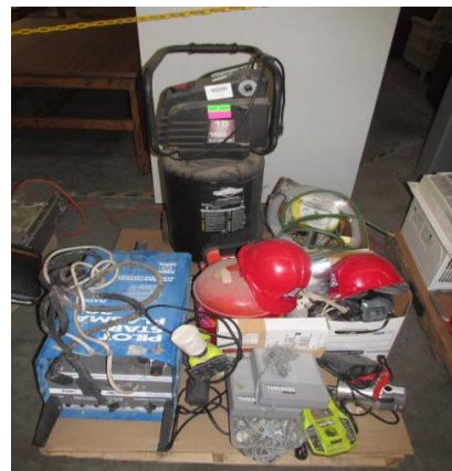
LOT 165 _____