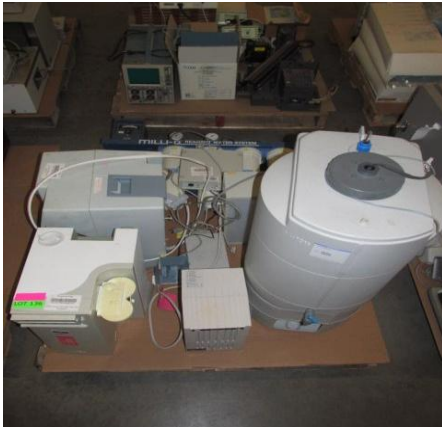
LOT 136 _____