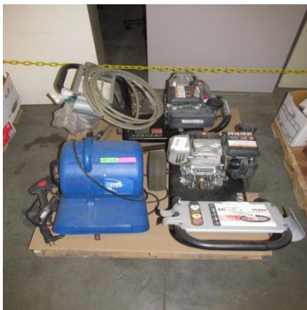
LOT 170 _____