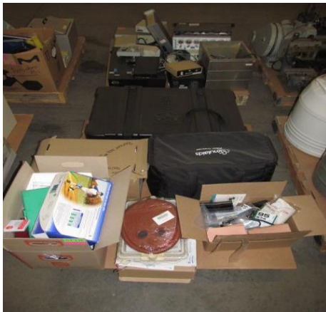
LOT 138 _____