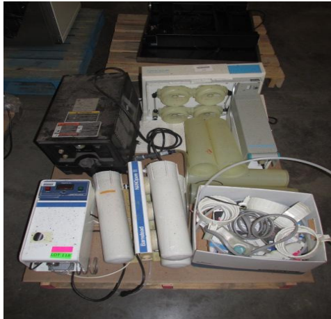
LOT 118 _____