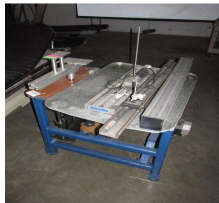
LOT 177 _____