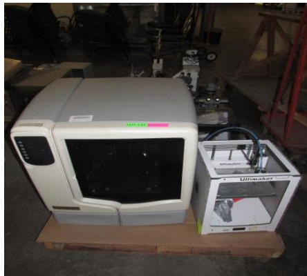
LOT 132 _____