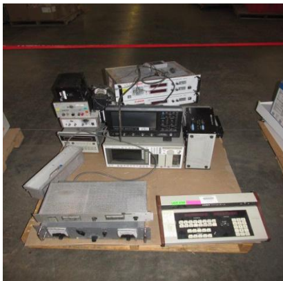
LOT 150 _____