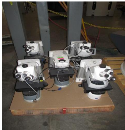
LOT 100 _____