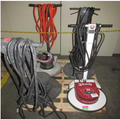
LOT 156 _____