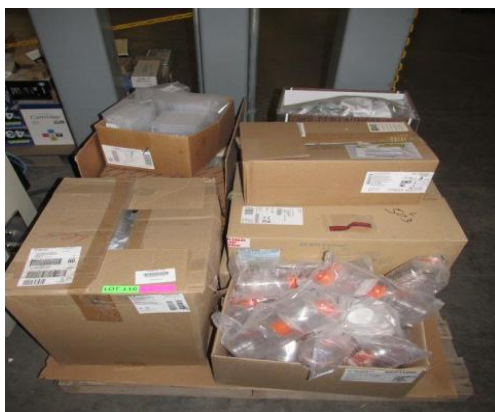
LOT 116 _____