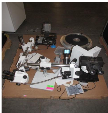
LOT 104 _____