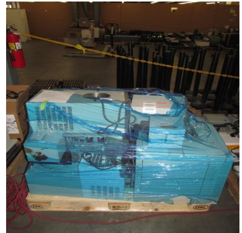
LOT 109 _____