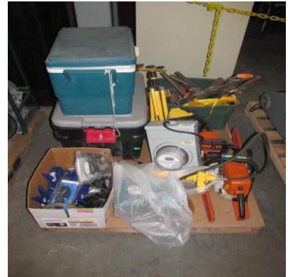
LOT 167 _____