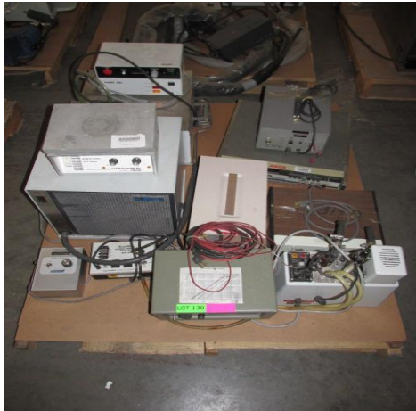
LOT 130 _____