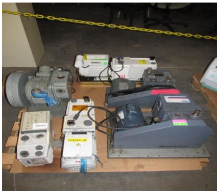
LOT 168 _____