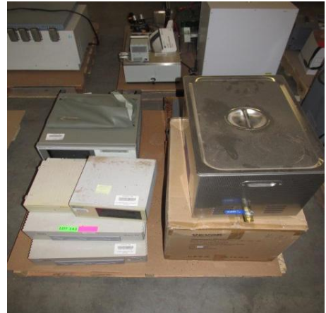
LOT 143 _____