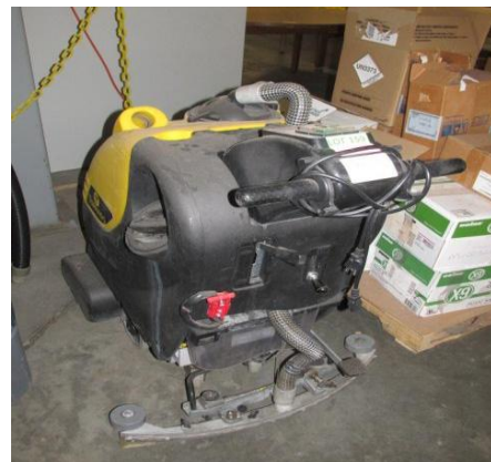
LOT 159 _____