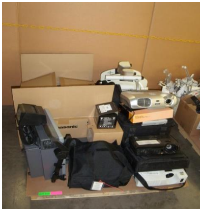
LOT 102 _____