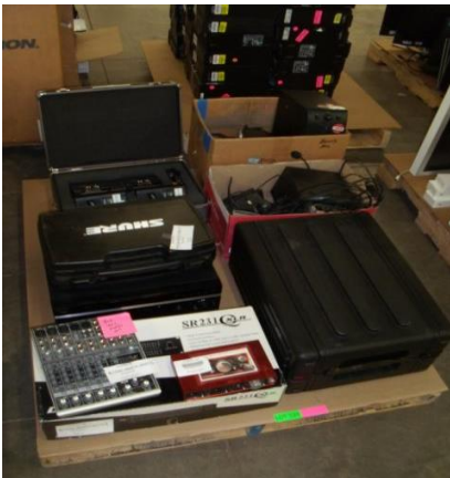
LOT 120 _____