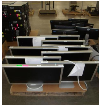
LOT 121 _____