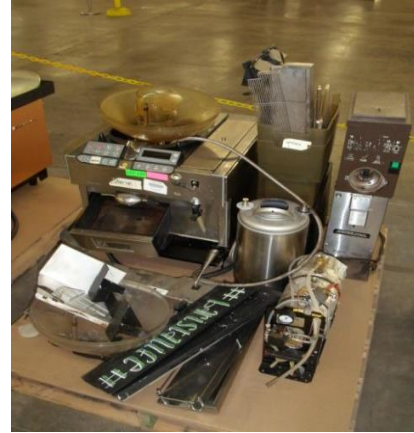
LOT 149 _____