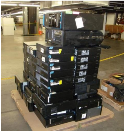
LOT 160 _____