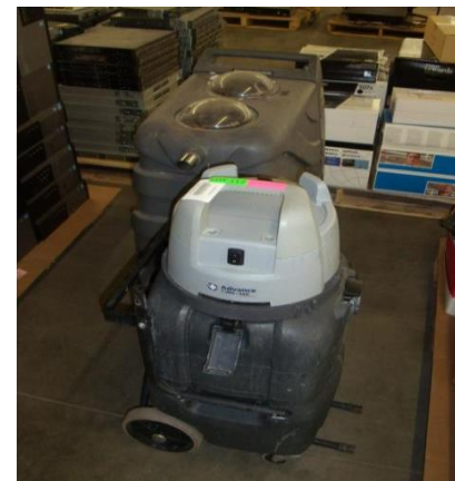
LOT 117 _____