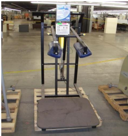
LOT 152 _____