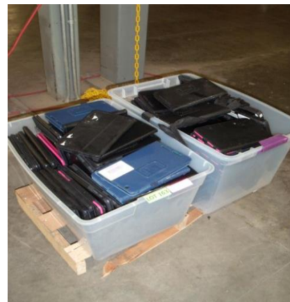
LOT 163 _____