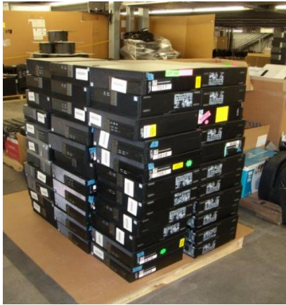
LOT 142 _____