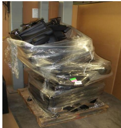
LOT 115 _____