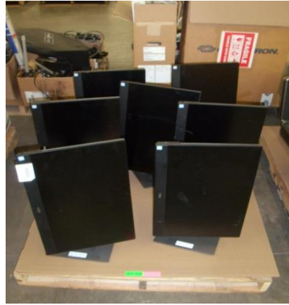
LOT 119 _____