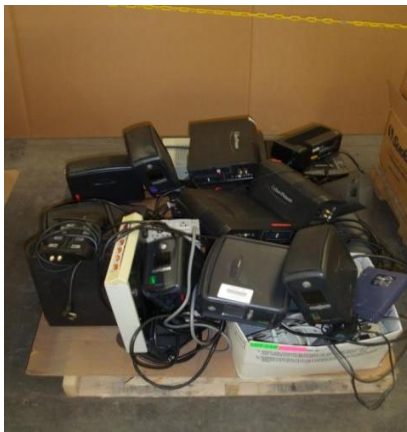
LOT 110 _____