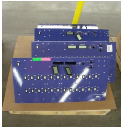
LOT 157 _____