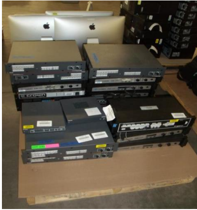
LOT 130 _____