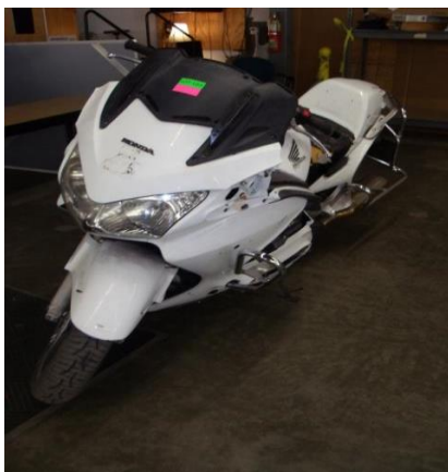
LOT 164 _____