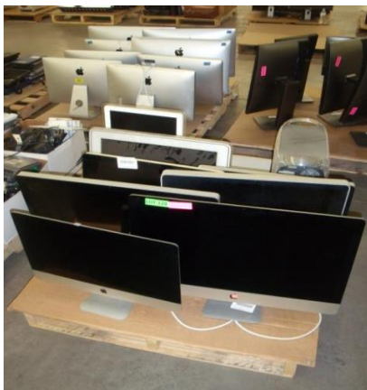
LOT 128 _____