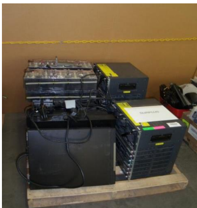
LOT 104 _____