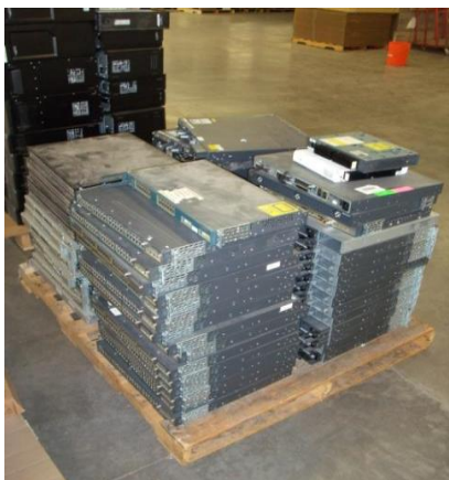
LOT 146 _____