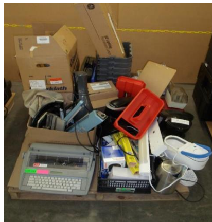
LOT 111 _____