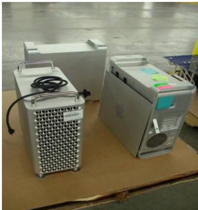
LOT 156 _____