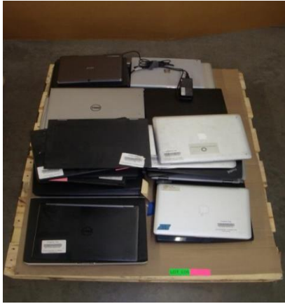
LOT 106 _____