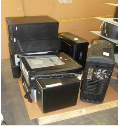
LOT 112 _____