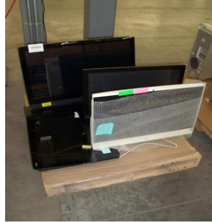
LOT 155 _____