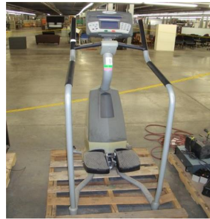
LOT 153 _____