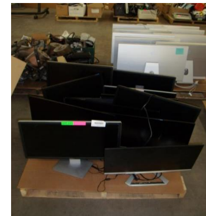
LOT 141 _____