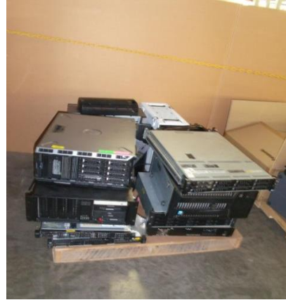
LOT 101 _____