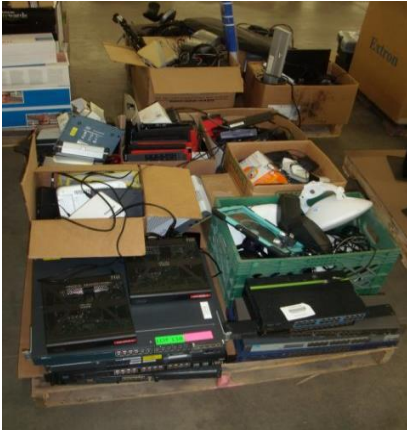
LOT 118 _____