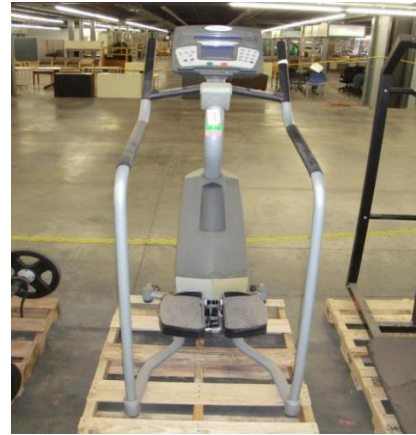
LOT 151 _____