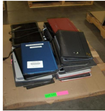
LOT 137 _____