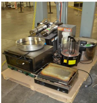
LOT 147 _____