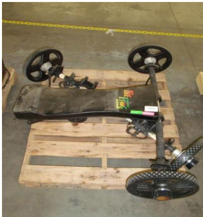
LOT 150 _____