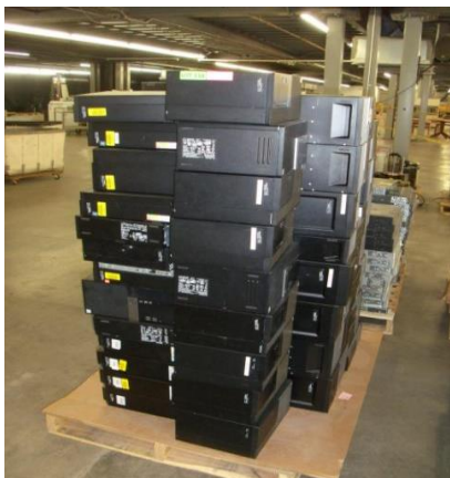
LOT 116 _____