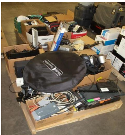
LOT 144 _____