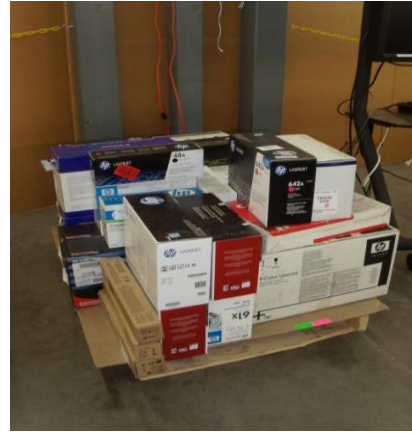
LOT 107 _____