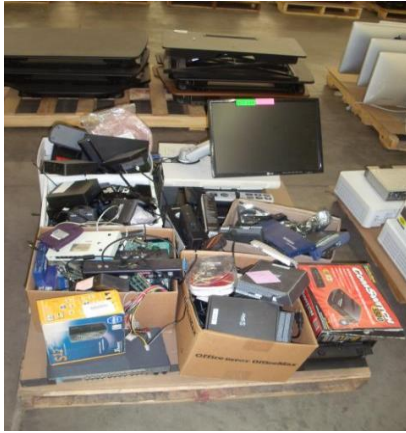
LOT 124 _____