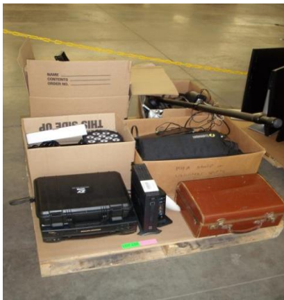
LOT 158 _____