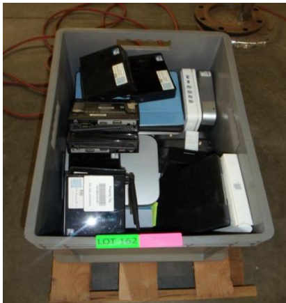
LOT 162 _____