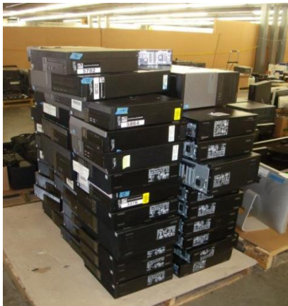
LOT 132 _____