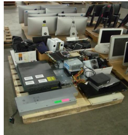
LOT 127 _____