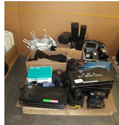
LOT 103 _____