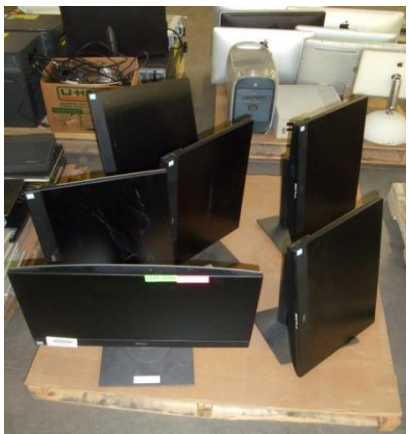
LOT 135 _____