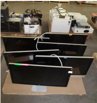
LOT 138 _____