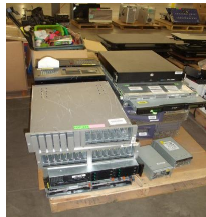
LOT 123 _____