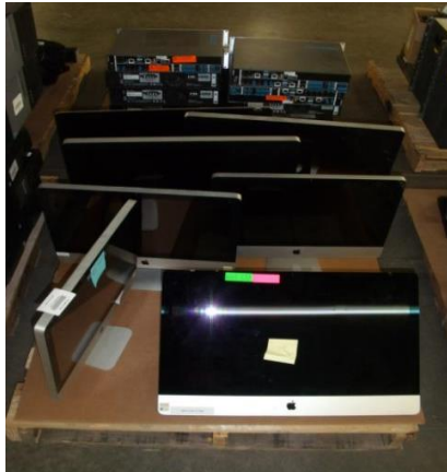
LOT 133 _____