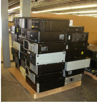
LOT 100 _____

***ONLY EVEN DOLLAR AMOUNTS WILL BE ACCEPTED NO CENTS PLEASE***