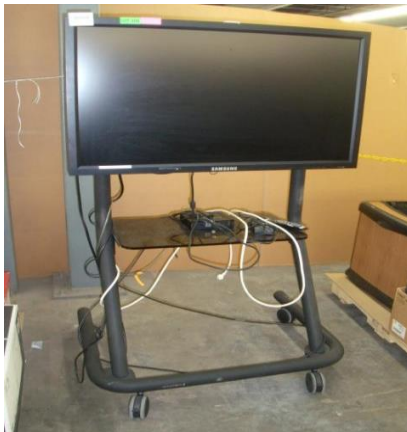
LOT 108 _____