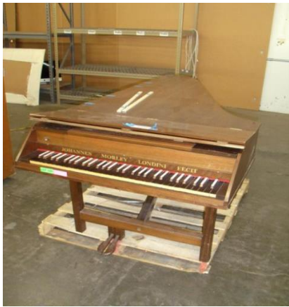
LOT 168 _____

Bids will be assessed the applicable Sales Tax unless a valid Resale License is provided. Please Print: