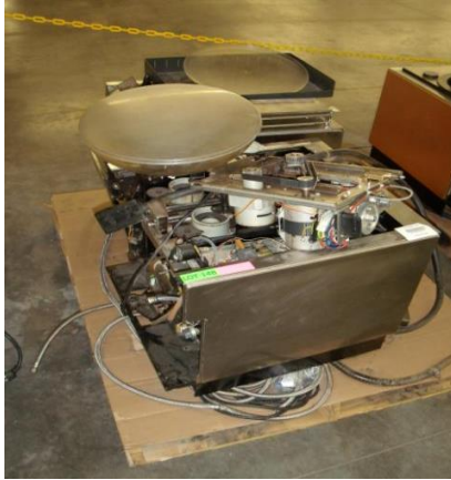
LOT 148 _____