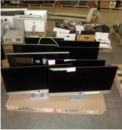
LOT 136 _____