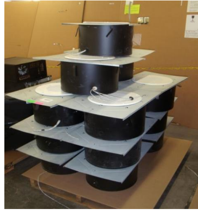
LOT 113 _____