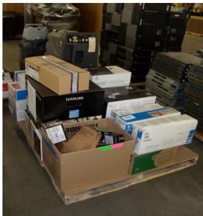
LOT 145 _____