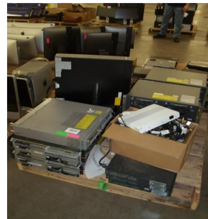
LOT 129 _____