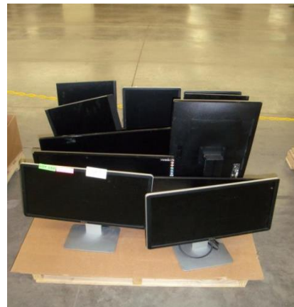
LOT 159 _____