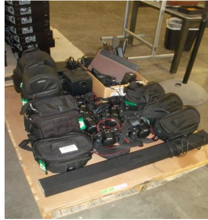
LOT 131 _____