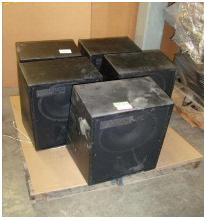
LOT 114 _____