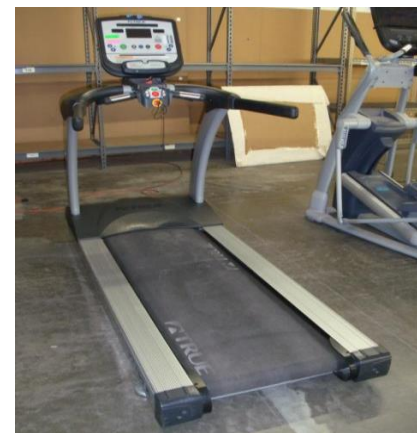
LOT 165 _____