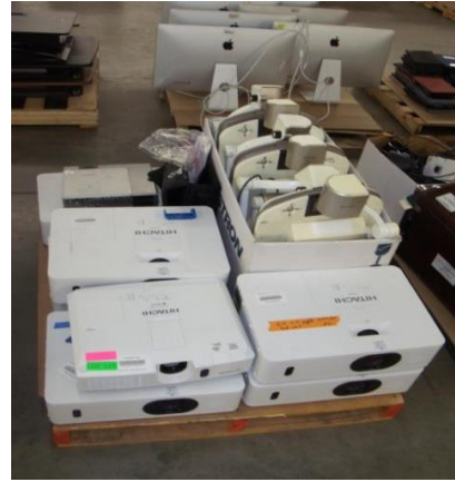
LOT 125 _____