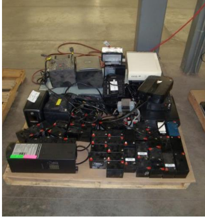
LOT 154 _____