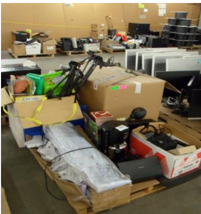
LOT 140 _____