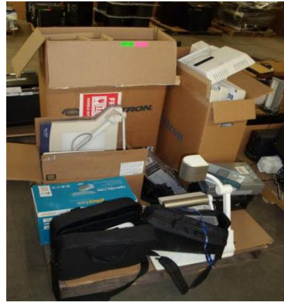
LOT 143 _____