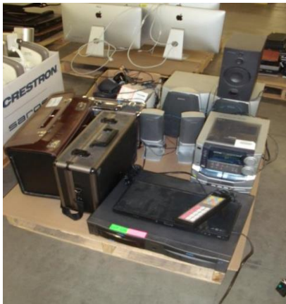
LOT 126 _____