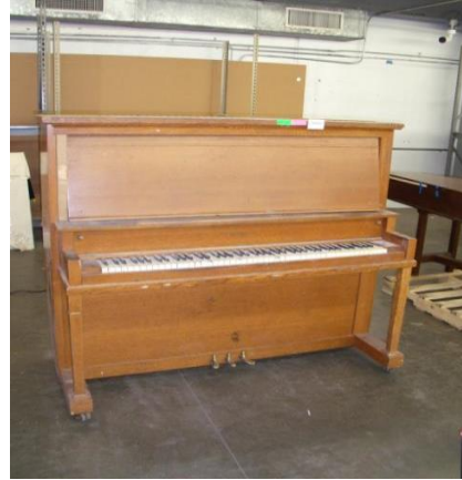
LOT 167 _____