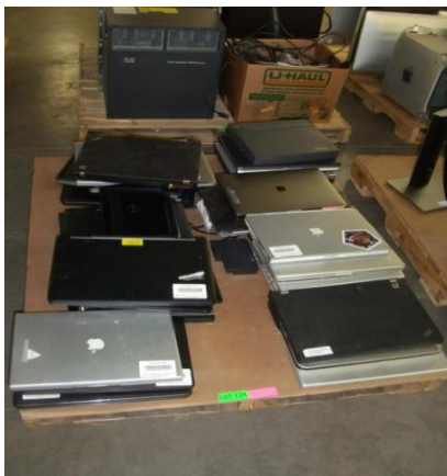
LOT 134 _____