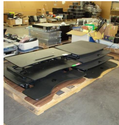
LOT 139 _____