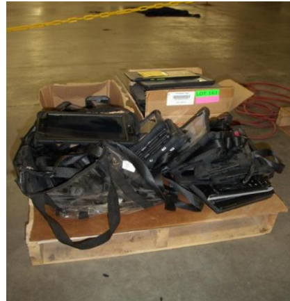
LOT 161 _____