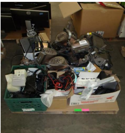
LOT 122 _____