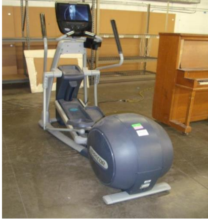
LOT 166 _____